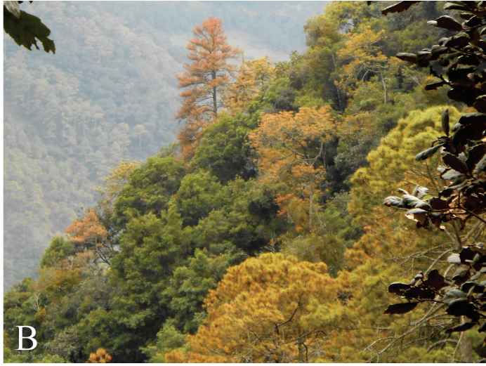
Fig. 1. A) Branch with initial pine decline symptoms. B) Landscape with Pinus trees affected by pine decline symptoms.