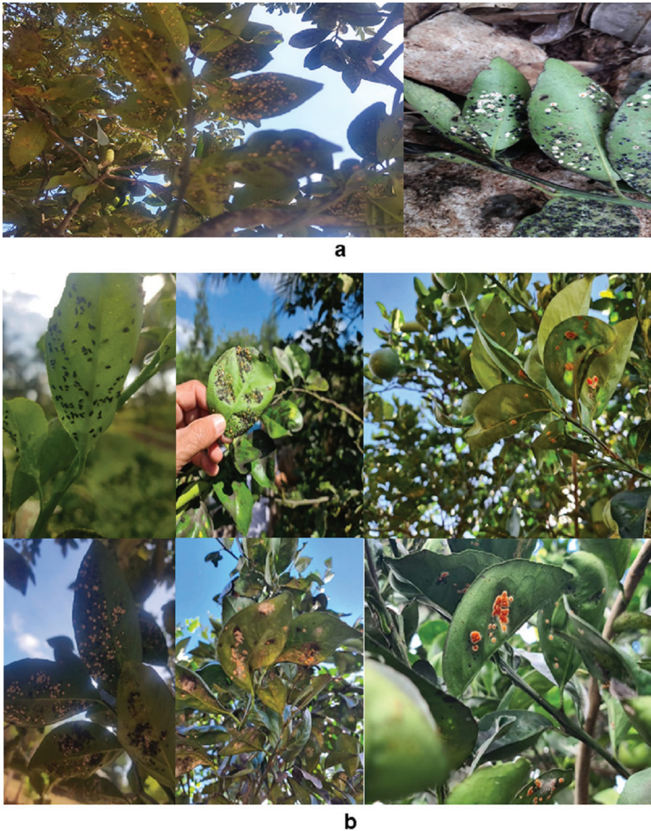
Fig. 2. (a) Epizootic caused by Aschersonia sp. on citrus blackfly nymphs after conidia application on 30 ha in Jose Maria Morelos, Quintana Roo, Mexico (late Nov 2018); (b) presence of Aschersonia sp. on citrus blackfly nymphs (Sep to Nov 2020) without conidia application in Jose Maria Morelos, Quintana Roo, Mexico.