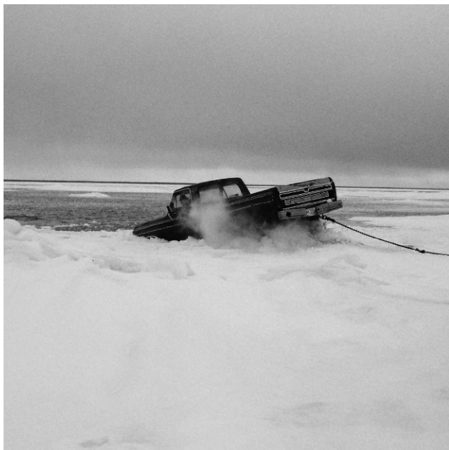
FIGURE 2. While returning from a hunting/fishing cabin at Button Bay west of Churchill in April 2005, a truck became stuck in unexpected flooding on the Churchill River estuary, an increasing occurrence in recent years.

"The foundation of the wind has changed, it's gone. The wind will now come from any direction, any time of the day. Before you could