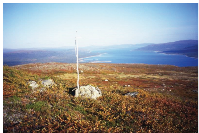
FIGURE 2. Stone cairn marking an old path leading to the slaughtering place of Boarek. Photograph by John Kuhmunen, 1999. Sirges community (Source: Åjtte, Svenskt Fjäll- och Samemuseum).

In Suorvvá [meaning the space where you can sit at the back of the sled], there is this formation