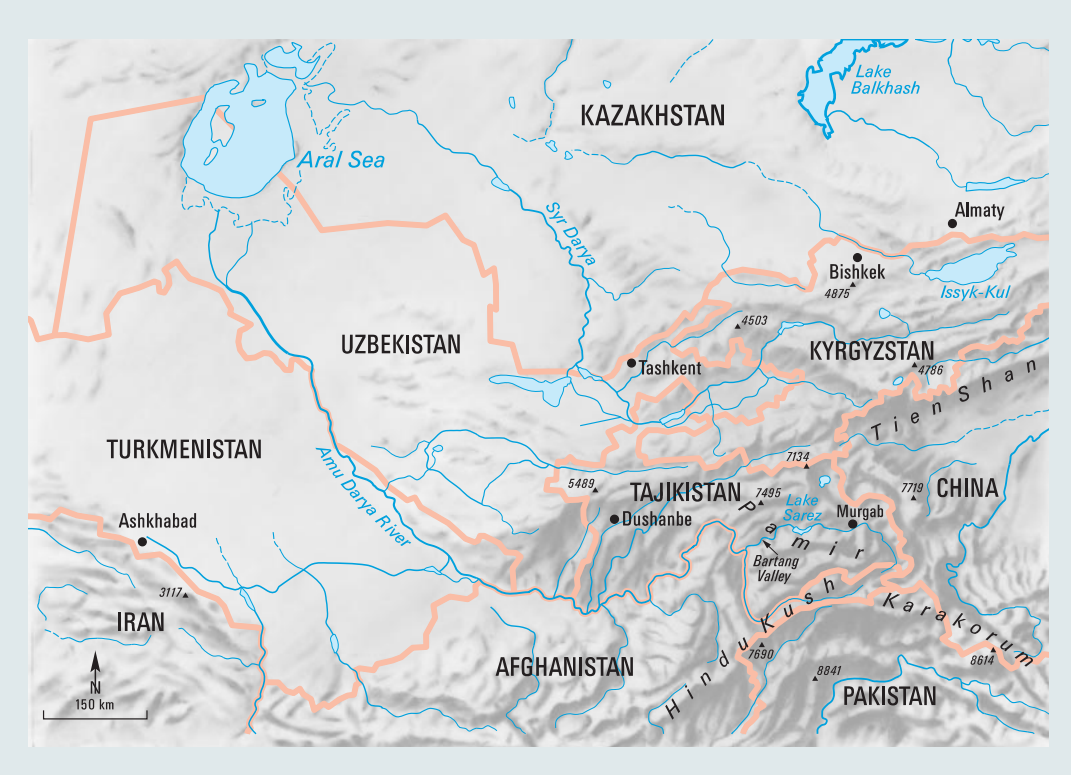
FIGURE 3 Lake Sarez is located in the Pamir Mountains of eastern Tajikistan, one of a number of Central Asian republics created by the Soviet Union in the early part of the 20th century. (Map by Andreas Brodbeck)

Landslide-generated Lake Sarez, and its potential to destroy downstream riparians as far as the Aral Sea, presents a major dilemma to the governments of the riparian republics along the Amu Darya as well as to international development agencies. Apart from the magnitude of the physical problem, historical, social, economic, and political factors make for a complex and urgent challenge to be met (see Figure 3).