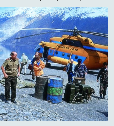
FIGURE 4 The 1999 United Nations/World Bank hazards reconnaissance party have just arrived at Lake Sarez, 3200 m asl, by helicopter from Dushanbe, capital of Tajikistan.

"A high-magnitude, low-frequency event, such as a major earthquake or an outburst flood, would totally over-whelm the existing response capabilities of the region, probably as far downstream as the Aral Sea, and would require massive assistance from the international community."