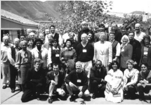
Participants at the first meeting of the Mountain Forum Council, Urubamba, 28 September 1999–1 October 1999.

At the kind invitation of the International Potato Center (CIP), the first meeting of the Mountain Forum Council took place in Urubamba, Peru, from 28 September 1999–1 October 1999. All 22 members of the Council, who had been nominated by their respective regional/global nodes, FAO, and the Swiss Agency for Development and Cooperation (SDC) were in attendance, as well as 20 special invitees, observers, and node managers. A detailed report of the meeting is in preparation.