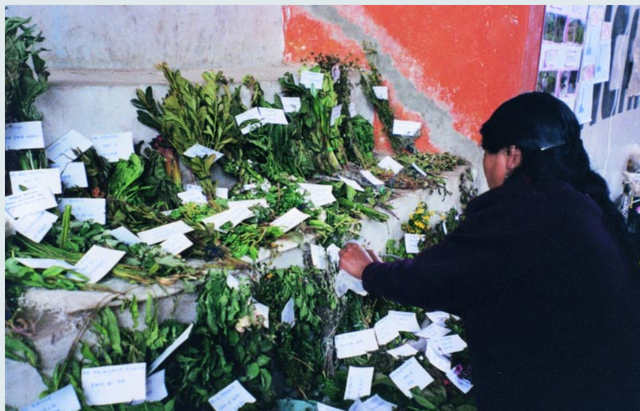
FIGURE 3 Campesina at a seed fair in Cajamarca, Peru, exhibiting medicinal plants used locally.

Plant genetic resources cannot be conserved if environmental conditions are not maintained at a level adequate for their regeneration. From this perspective, rehabilitation and conservation of soil and water resources are basic requirements for creating a prosperous environment on plots where in situ conservation of agricultural diversity is planned.