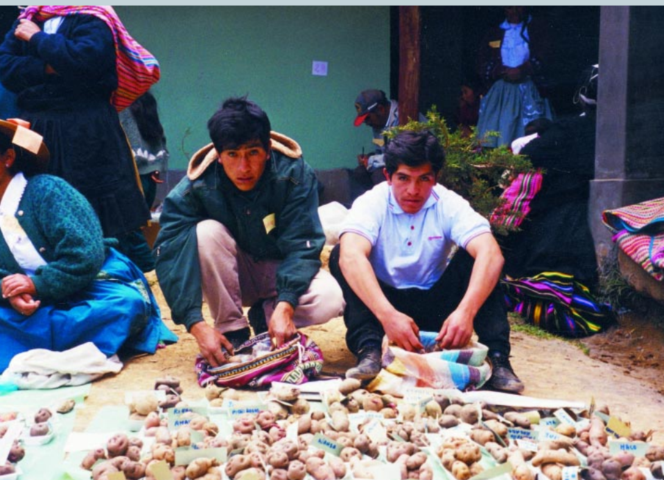
FIGURE 1 Potato varieties displayed at a seed fair in Huancayo, Peru.

result of several years of experience in rural development projects. This model includes so-called seed fairs (Figure 1) and encourages the creation of local seed banks managed by a conservationist campesino association. The HimalAndes Project, which promotes technical cooperation to support exchange of seeds and local knowledge between mountain agriculture ecosystems, is another recent project with a partial focus on agrobiodiversity conservation in Andean and other countries.