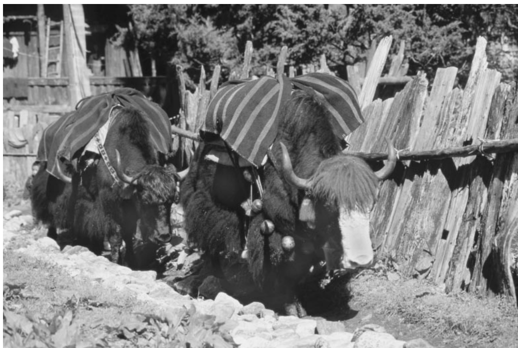
FIGURE 3 Yaks transporting potatoes to the winter settlement at Phale. (Photo by U. Müller-Böker, September 1998)

(non-user-group members) have to pay fees. A healthy population of blue sheep above Khānpāchen (Brown 1994) indicates that the local management of pastures is not only sustainable, but also supports wildlife. Since the refugee residents of Phale do not have pastures or pasture rights, they have a system of coherding with the residents of Ghunsā. In exchange for half the production ( ghiu, churpi ), Ghunsā herders take Phale livestock to their summer pastures. The livestock is kept near Phale in winter. Another group using Ghunsā's pastures are Chetri shepherds from the Tapplejuñ area, who practice extended transhumant migration.