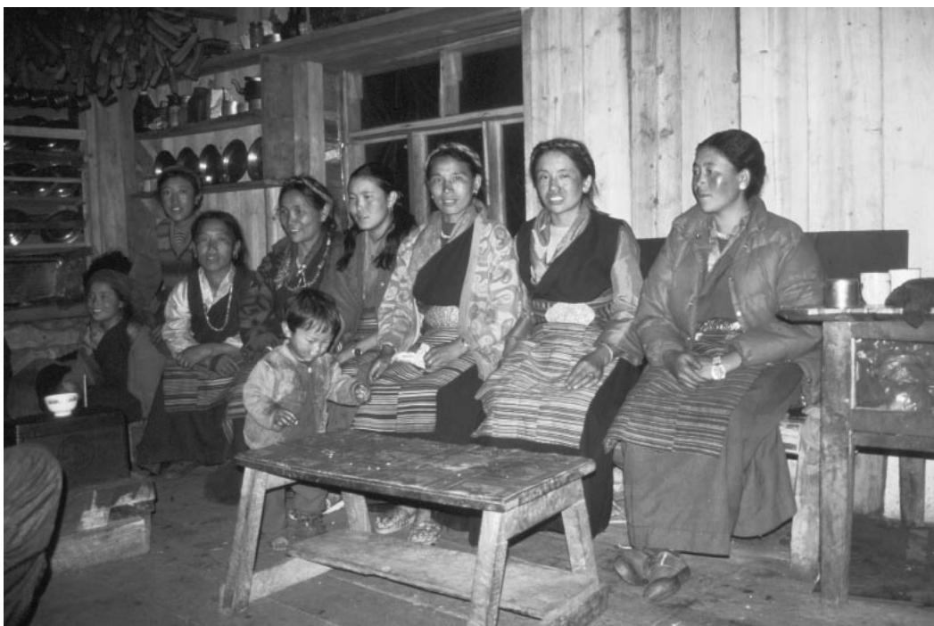
FIGURE 4 A group of women in Ghunsā preparing for a meeting. (Photo by U. Müller-Böker, September 1998)

against the project, had already led to rumors about stationing of troops, prohibition of forest resource use, and grazing restrictions. The KCAP team had to learn the following lesson: “As a result of misinformation, it was very difficult for the extension team to build trust with the local communities and address conservation issues” (KCAP 1998: 12).