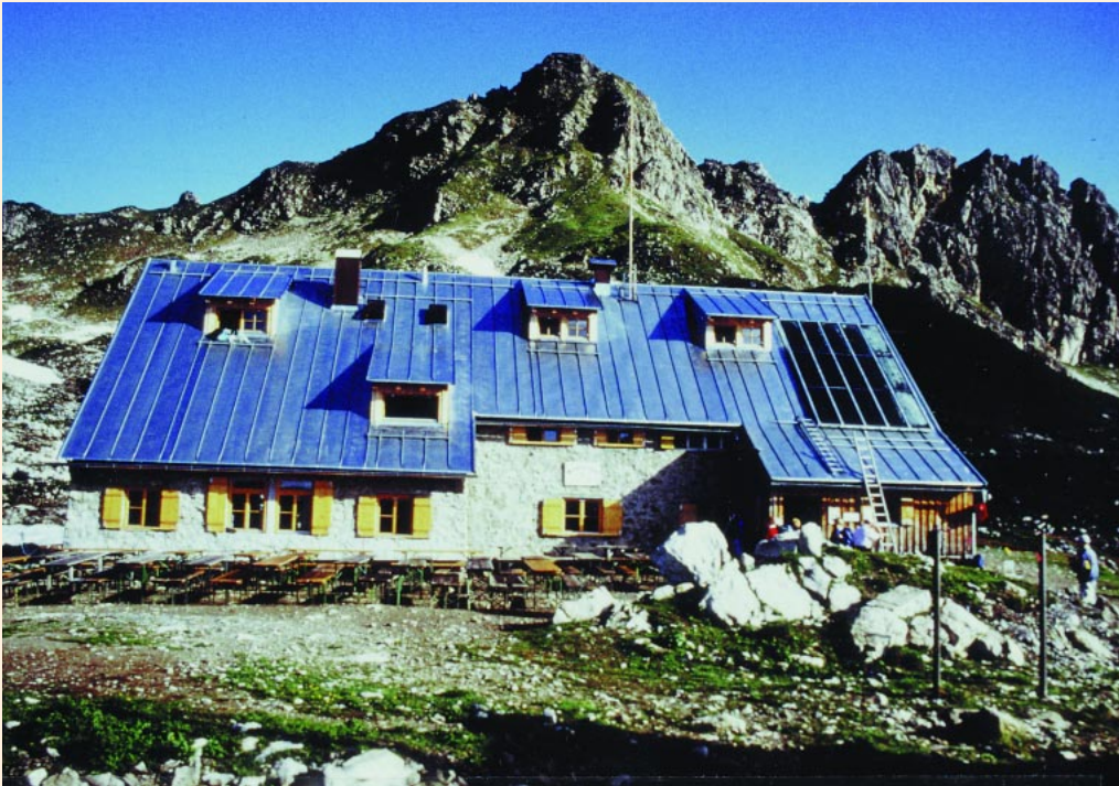
FIGURE 5 Use of stand-alone solar power is spreading in the European Alps, where tourism has become a very important source of livelihood for local populations.

tend to be far more conscious of the need to use energy sparingly (Figure 6).