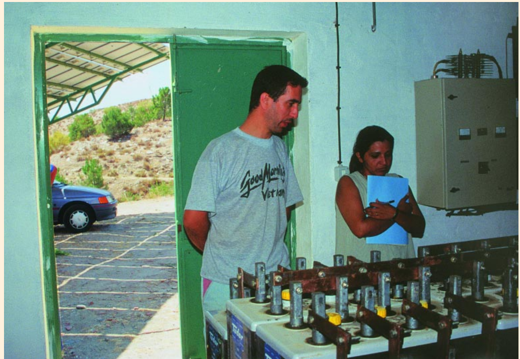
FIGURE 4 The stand-alone village power system of La Rambla del Agua in Spain was financed by the local authorities, the European Commission, and the users. A local and a regional users' association (Virgen de la Piedad and SEBA) are in charge of management and maintenance. Productive capacity (10 kWh) caters to the needs of 40 households.

For us, it is important to have support for maintenance and repair, although we do the most basic things ourselves. If something happens, we can count on our user association. This gives us the confidence we need. (Spanish user, July 1999)