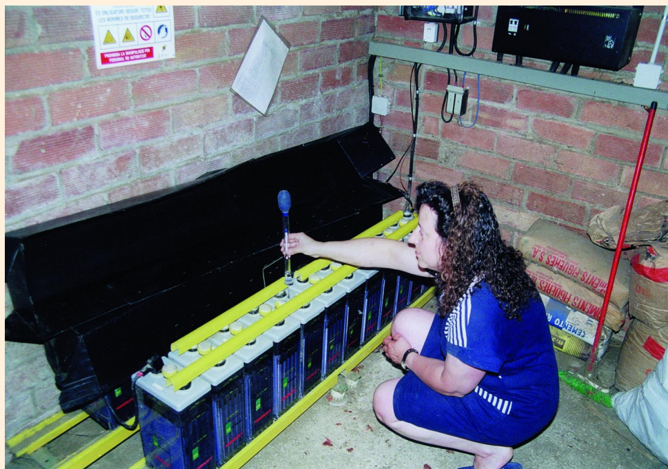
FIGURE 3 A user confidently checks the batteries of a stand-alone system in the Pyrenees.

tem is necessary. User workshops provide further information and lead to a cooperative relationship among users.