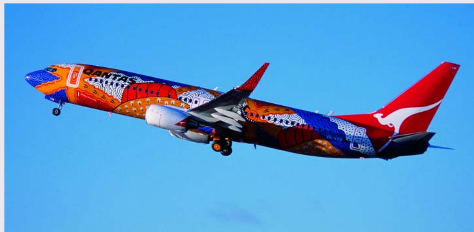
FIGURE 2 Images of Aboriginal life and culture are used in promotional strategies, eg by the Australian Tourist Commission and the national airline, Qantas, to differentiate Australia from other destinations. Pictured here is Qantas’s newest Aboriginal design aircraft, “Yananyi Dreaming.” The patterns are traditional designs and symbols from the “dreaming” of 29 tribal Aboriginal artists from Uluru (Ayers Rock), whose heritage encompasses a “stone-age” hunter-gatherer society living in remote desert regions. They were assisted by Aboriginal artists from the Balanji Art Gallery in Sydney. While Qantas uses Aboriginality for image creation and marketing, it has also accepted that it must obtain the permission, approval and participation of Aboriginal artists.

(Kuku Yalanji Guide, Mossman Gorge, Australia, January 2002)