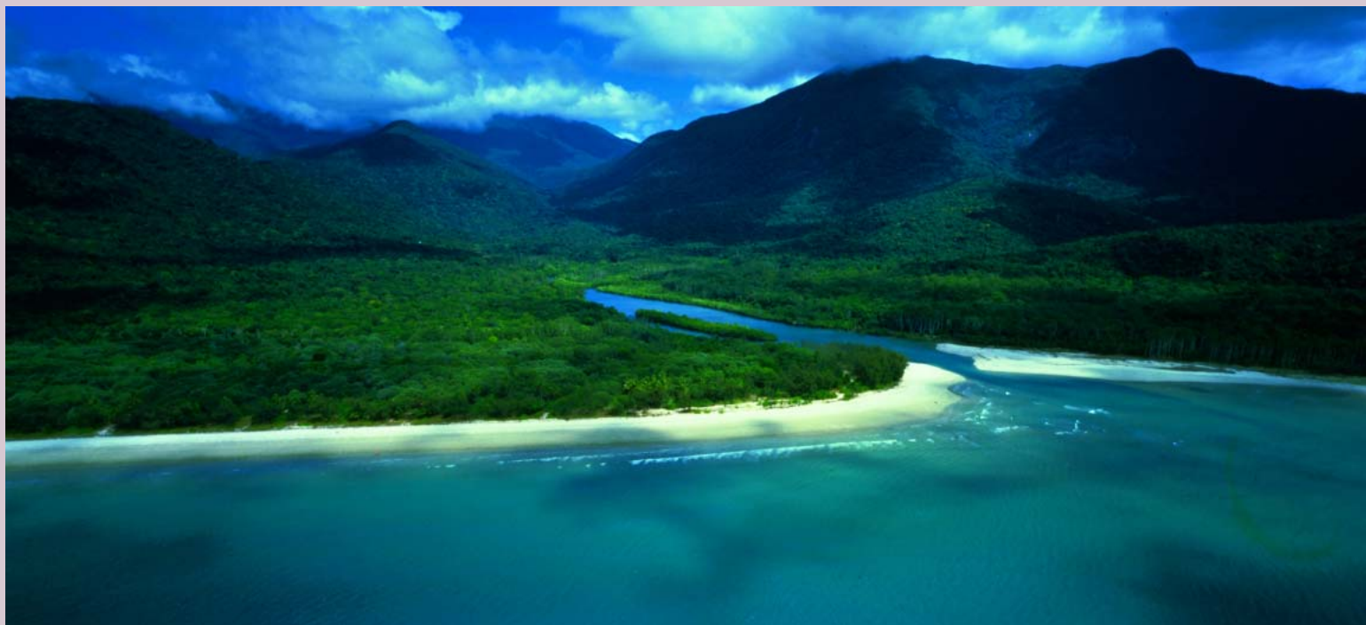
FIGURE 1 The Daintree Coast south of Cape Tribulation, in the northern part of the Wet Tropics World Heritage Area, northeast Australia. The Daintree Range to the west of this coast is part of the Kuku Yalanji tribal lands.

addressing indigenous minority poverty and marginalization, it is an area of significant potential because of its sociocultural “fit” with indigenous society’s oneness with the environment. Indigenous ecotourism and the mountainous tropical wet rainforest region of northern Queensland, Australia (Figure 1) may be viewed as “perfect partners” given the interdependency of the biophysical environment and its original Aboriginal inhabitants, which goes back approximately 40,000 years in time. This paper gives a brief introduction to the issues related to Aboriginal rights and tourism in Australia and examines the way in which ecotourism has provided a revitalization of that interdependency and extended the human–biosphere relationship in new directions in northern Queensland.