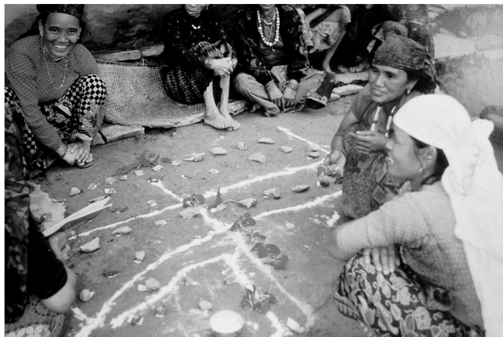
FIGURE 2 Women's knowledge of seed varieties, cultivation, storage, and use is a valuable form of human capital often ignored by policy and decision makers. Here, women construct a "seasonal calendar."

The Kirats, who are one of the oldest ethnic groups in the region, until recently practiced a distinct system of communal land tenure known as kipat . In the decades following a "unification" drive in the mid-18th century to unite Nepal under its present system of monarchs, the Kirats were confronted with numerous challenges to their traditional way of life. The influence of the dominant lowland Hindu groups, combined with the self-interested activities of local headmen or tax collectors ( jimmawal N), led to fundamental transformations of sociocultural practices and land management systems. Extensive areas of forest where traditional swidden practices once dominated were replaced with the ubiquitous rain-fed ( bari N) and irrigated terraces ( khet N) suitable for wetland paddy crops (Sagant 1996; Gurung 1997). Perhaps the most significant outcome of the unification drive was the gradual out-migration of Kirats eastward to Sikkim and beyond because lowland Hindus were actively encouraged to migrate to upland kipat areas (Regmi 1965; Caplan 1970; McDougal 1979). This historical precedent anticipated the increasing trend in out-migration today, with men now seeking employment in urban