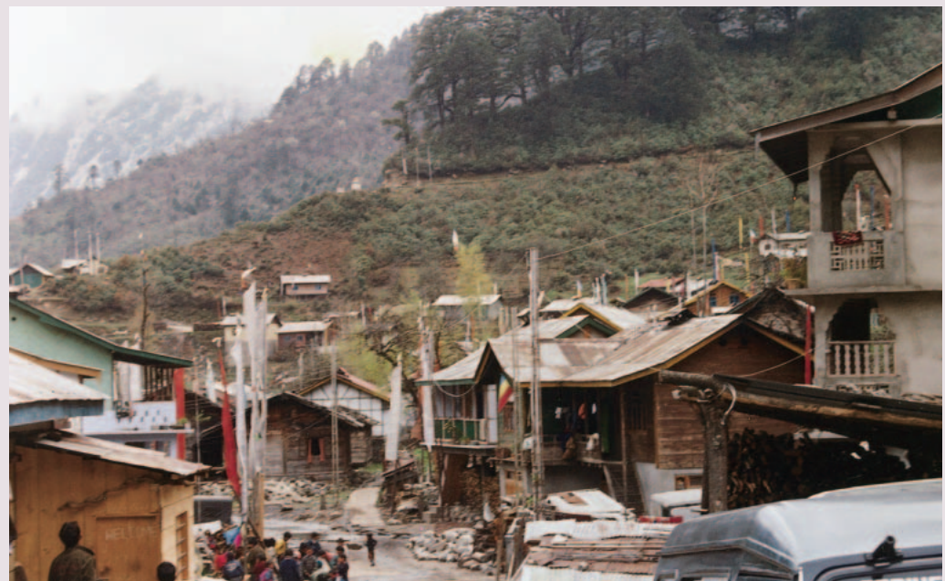
FIGURE 4 A high-altitude permanent fringe area settlement near the KBR.

Hence, conflicts are likely to crop up only when the real pressure of conservation restrictions begins to affect socioeconomic conditions and the traditional practices of people living in fringe area settle-