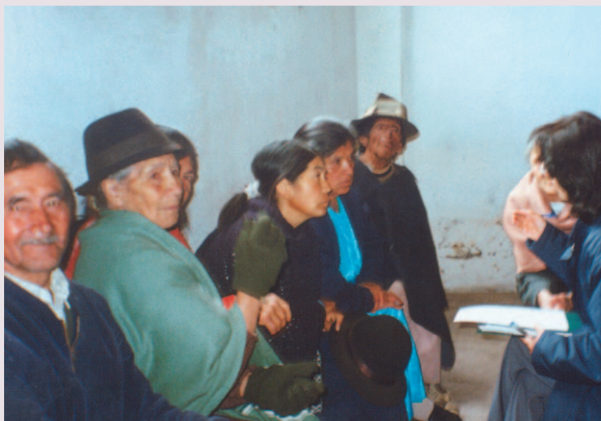
FIGURE 2 Meeting of the water users’ associations that share canal in the Mocha Quero and Pelileo cantons. The participants are attempting to reach consensus about water management.

Several institutions are currently working for the Proyecto Manejo de la Cuenca Hidrográfica del Río Ambato project (PROMACH). Through an interinstitutional strategy of consensus, these institutions are seeking sustainable ways of dealing with the watershed’s renewable natural resources. They support the Provincial Executive Commission, whose main duty is to facilitate solutions to the existing problems.