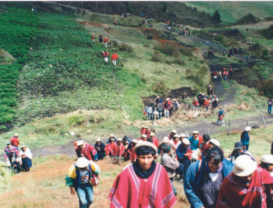
FIGURE 3 Chibuleo Páramo resource users walking in the highlands to identify the topographical features of the area to make a determination about equitable distribution and joint management of resources.