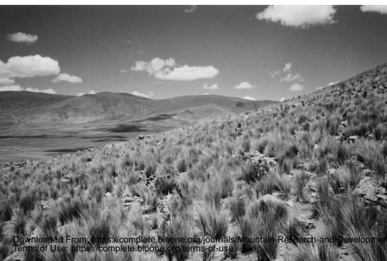
FIGURE 2 Vestiges of prehistoric terraces near Chorcoya, Tarija altiplano. These remnants indicate that the climate was once more favorable to cultivation in this dry area.

The basins of the Tarija altiplano are internally drained, and lakes mark points of water accumulation.