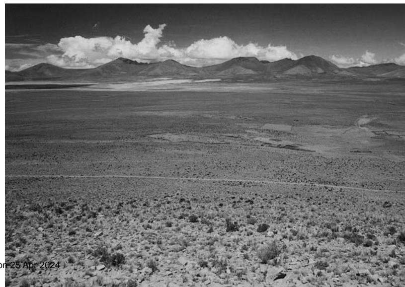
FIGURE 4 Tarija altiplano south of Chorcoya. This view shows walled fields, some of which are seasonally cultivated, extensive grazing areas, saline lagoons, and an accumulation of wind-blown sand in a small area of sand dunes.

Grazing pressure alone cannot therefore explain current differences in biomass. Sheep graze both the plateau and the mountain slopes and also graze pastures on the other side of the watershed. It is probable that the use of multiple zones has increased with time because livestock numbers have increased and alternatives to the more convenient plateau grazing were needed. The low biomass on the plateau may be influenced more by historical than by current grazing pressure.