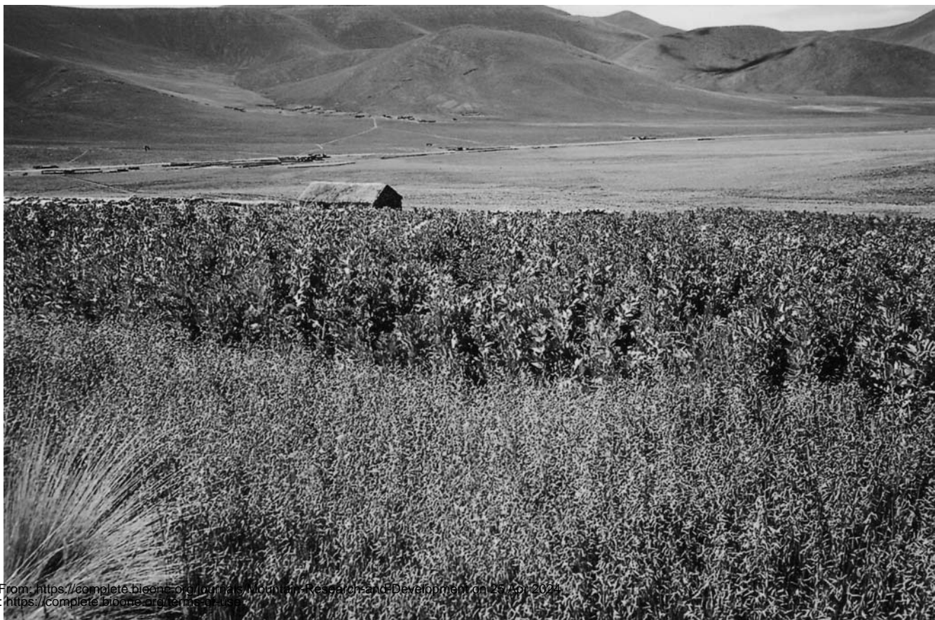
FIGURE 5 Community livelihood in Chorcoya depends on seasonal migration, grazing, and cultivation where water is available. Pictured here are oats and broad beans irrigated from a hillside spring.

Although pastoralism is a crucial element in the livelihood of altiplano people, like crop farming (Figure 5), it offers security rather than a satisfactory income or a good quality of life. It is uncertain whether livelihoods that combine pastoralism, some cultivation, and seasonal migration will be able to meet the rising