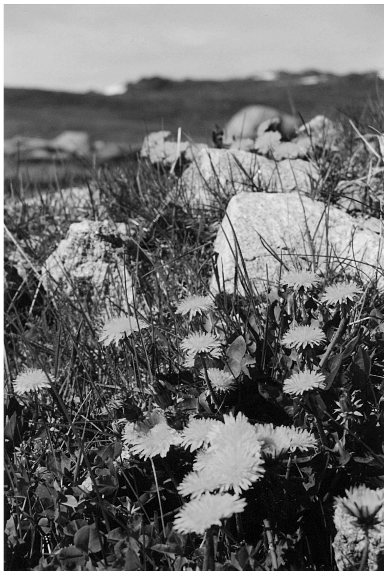
FIGURE 3 Dandelions ( Taraxacum officinale ) and clover ( Trifolium spp) growing along the edge of one of the gravel tracks near Mt Kosciuszko. Gravel track types often have a weed verge, whereas other track types, such as raised steel mesh walkways, do not provide weed habitat. Weeds are a problem in the alpine area; the diversity and abundance of weeds is likely to increase with predicted climate change.

water quality was feral animals, such as horses, pigs, foxes, cats, and in-stream trout introduced for recreational purposes. The impacts of feral fish on stream ecosystems are well recognized, with trout shown to reduce native fish populations within mountain creek systems in Australia (Cullen and Norris 1989; Green and Osborne 1994).