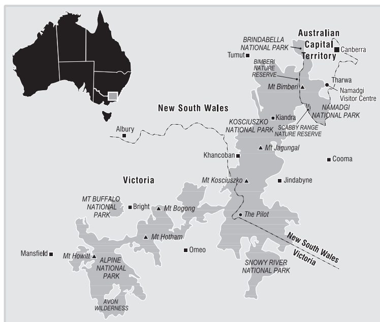
FIGURE 1 Australian Alps protected areas. Modified from AALC (1999).

Winter seasonal snow in Australia is restricted to the southeastern corner of the mainland and parts of Tasmania (Green and Osborne 1994). On the mainland, snow cover is regularly found only on a series of linked ranges and peaks known as the Australian Alps. The area is of outstanding biological importance, containing many endemic plants and animals as well as geological features of high conservation value (Mosley 1988). The protected area network of the Australian Alps includes Kosciuszko National Park, which contains the continent's highest mountain (Mt Kosciuszko, 2228 m), the entire alpine area, and most of the subalpine areas of New South Wales (Pulsford et al 2003). In Victoria, the high country is conserved in Alpine National Park, the Avon Wilderness, Snowy River National Park, and Mt Buffalo National Park (Figure 1; Pulsford et al 2003).