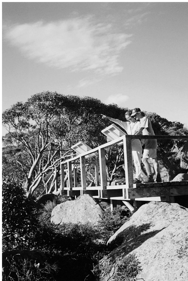
FIGURE 4 Sightseeing is the second most popular activity in the Kosciuszko alpine area. Lookouts such as this one at Charlotte's Pass provide visitors with interpretation and safety messages. This type of wooden structure protects the immediate environment from excessive trampling.

Norris 1999; Growcock 1999; AALC 2000; Buckley et al 2000). Changes in creek flow regimes as a result of snowmaking, snow grooming, and harvesting have been found, although most research is for mountain regions overseas (Good and Grenier 1994; Growcock 1999).