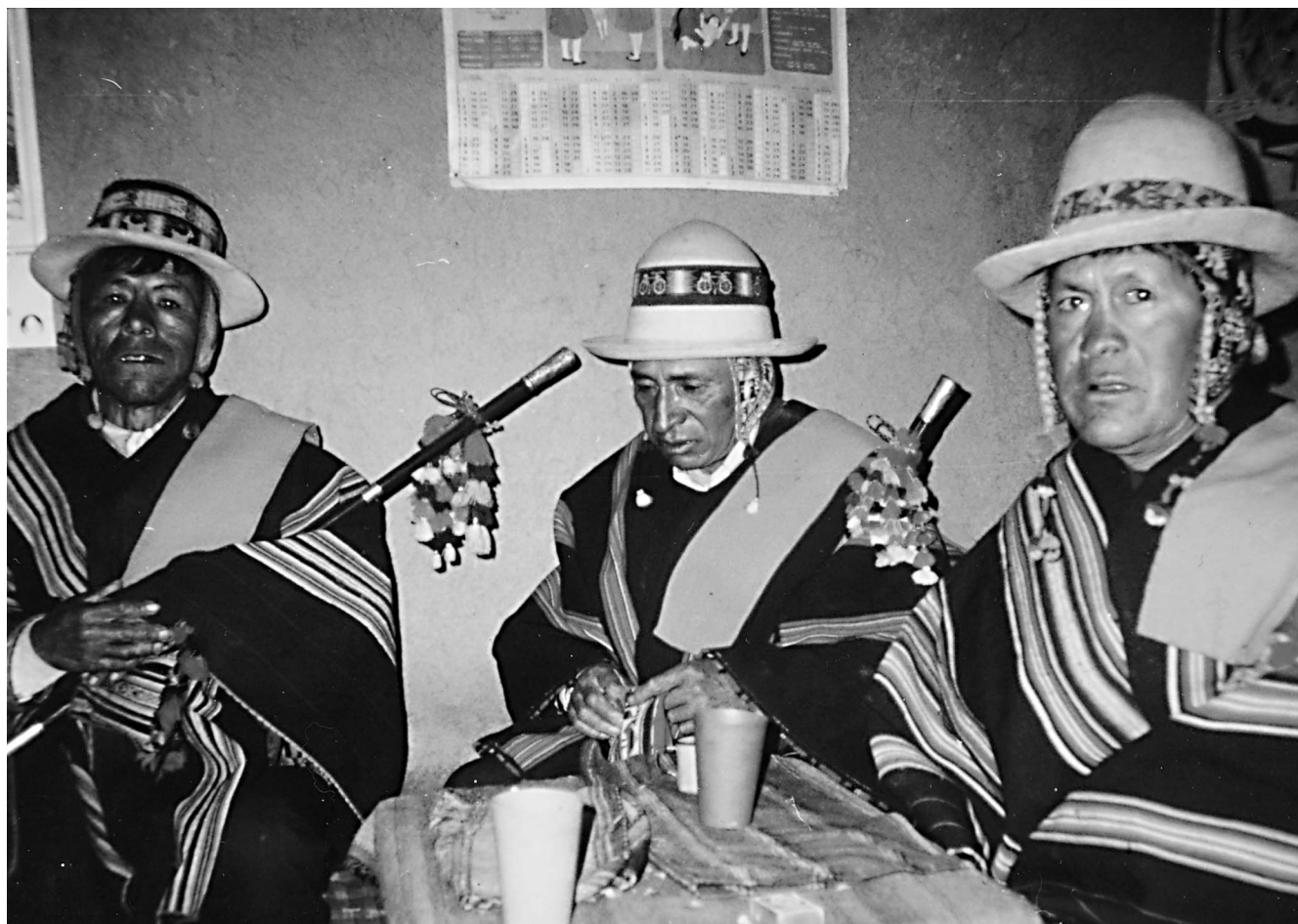
FIGURE 1 The 3 mallkus are the highest authorities of the ayllu . The symbols they wear represent the link between present-day ayllu organization and organization during colonial and precolonial times.

to different periods in the evolution of their land-use system. Using a transdisciplinary approach, the study was part of a process of “accompaniment” of communities based on intercultural dialogue (Rist et al 1999).