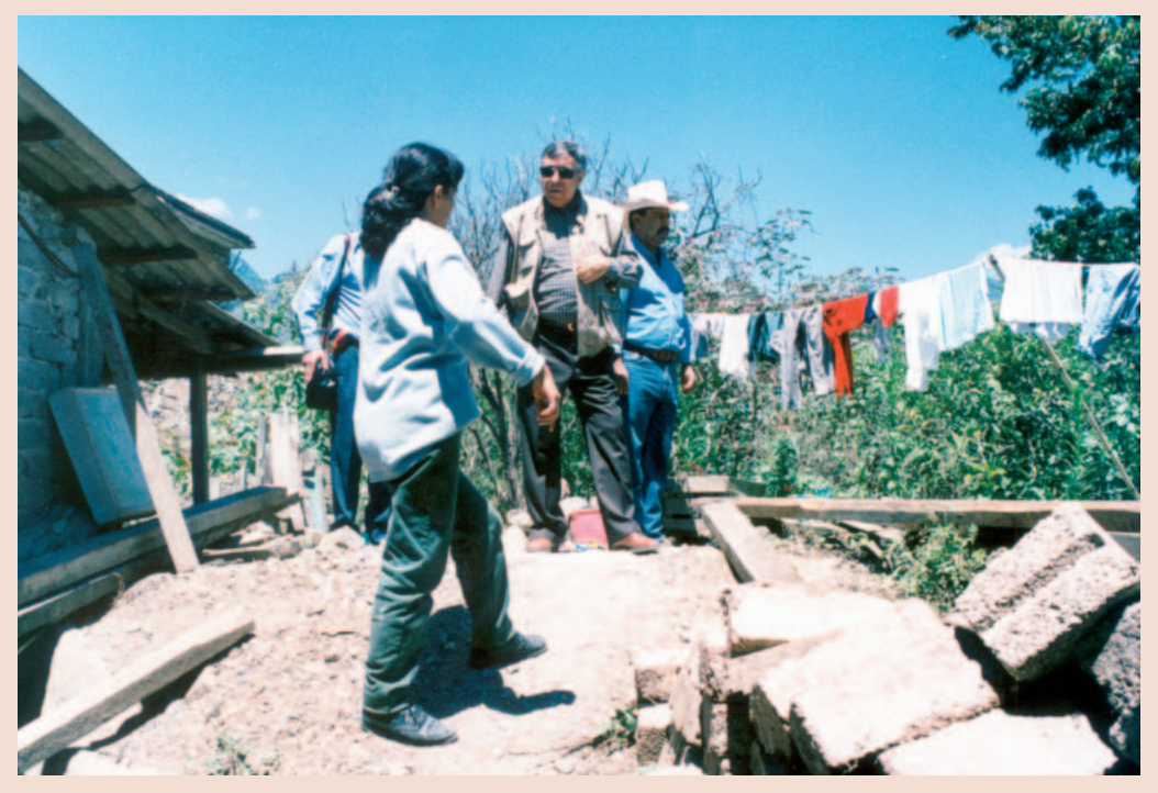
FIGURE 3 Involvement of local actors is a key to development of adequate strategies for disaster prevention. The high level of vulnerability of the local population is also reflected in poor housing conditions.

disaster processes in mountain areas in least favored countries is undoubtedly urgent. On the one hand, there is a lack of scientific research regarding instrumentation, monitoring and modeling in these areas, and a need to better understand the processes themselves, including the potential impact of extreme rainfall events and the role deforestation plays in soil hydrology. On the other hand, considerable further attention is needed to assess the vulnerability levels within communities. When conducting vulnerability research, it is crucial to consider factors such as social, economic, political and cultural issues, which ultimately determine the predisposition of the endangered communities to confront disasters.