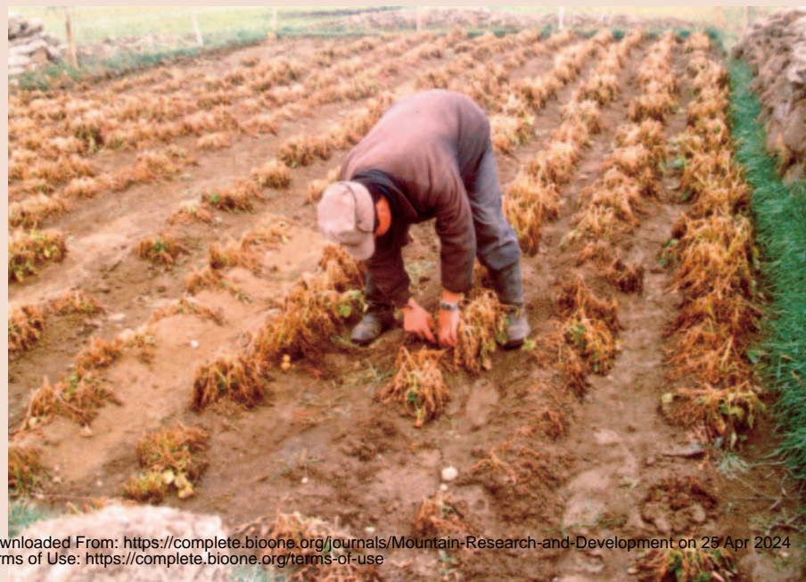
FIGURE 3 A herder in Karatau, Deluun sum, monitoring experimental production of potatoes.

Small community funds are made available to support these experiments. This set of actions is bringing together herders and government officials to experiment together and to make a start on defining locally appropriate, new common rules and regulations. Encouragingly, more and more herders are showing interest in joining the 3 existing groups, or in forming new groups. However, legal