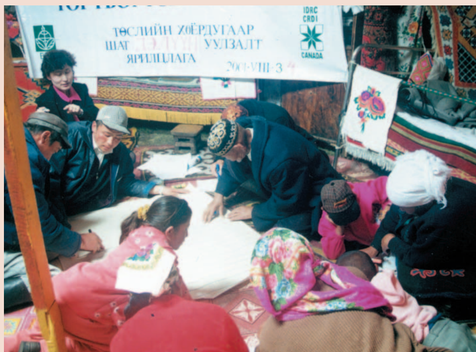
FIGURE 4 Herders of Karatau community and researchers discussing co-management options inside a traditional ger.

Several national policies and laws impact on herders' lives and livelihoods, most notably the new Rural Development strategy and the (new) Land Law. The Land Law was approved in 2002, and has been in effect since 1 January 2003. Other laws are currently being drafted, such as the Pasture Use Fee Law, and the Water Law. Team members have been and continue to be actively involved in policies and the law-drafting process. They qualify the new Land Law as "an improvement, but not yet perfect." The law introduces long-term pasture lease by the State to herder