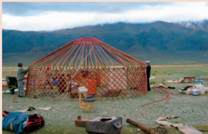
FIGURE 2 Families wrapping and packing their belongings, checking and double-checking the means of transportation, and getting their animals in good shape for the sometimes lengthy voyage. Everybody is waiting anxiously for the right moment to “move house.”

With an average herd size of 130 head per herding family, nomadic livestock producers are the backbone of the Mongolian economy. Agriculture—read livestock production—accounted for over a third of the Gross Domestic Product (GDP) in 2000 and employed almost half of the country’s labor force. More than these numbers can indicate, herding is a way of life rooted in the country’s long history.