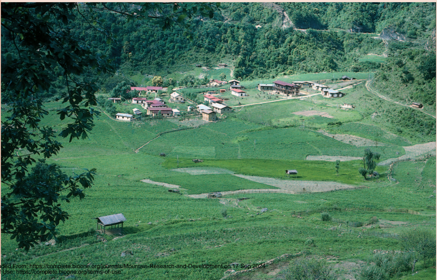
FIGURE 1 Potato field in Khaling (Trashigang district). Ten years after the village became accessible by road, almost every household had adopted potato production for export.

during the 18 th and 19 th centuries, they never became a staple food. By the middle of the 19 th century, many farmers had abandoned potato cultivation because of the poor yields caused by wart disease. The main impetus for current potato cultivation came from road construction in the early 1960s, which made temperate