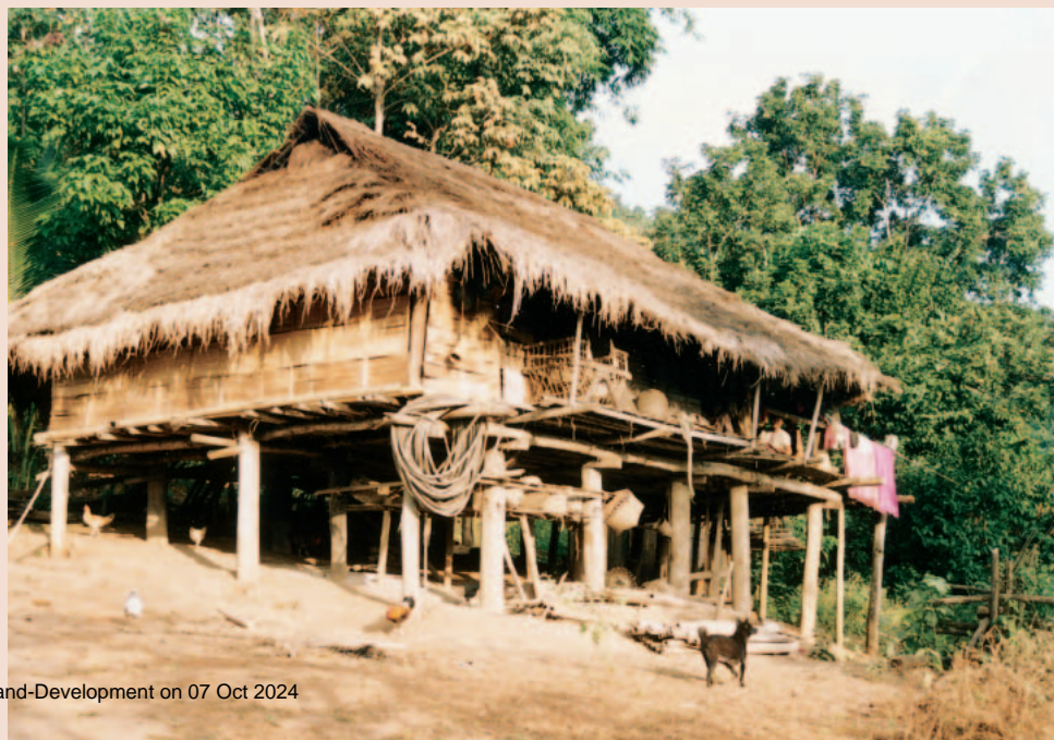
FIGURE 1 A traditional Karen house, Pae Por Highland Development Project.

Both projects aimed to raise the living standards of hill tribe populations by “improving socioeconomic position and self-reliance and progressive integration into the mainstream of Thai society,” as they declared in their project documents. Pae Por Highland Development Project (HDP) was executed by the Department of Local Administration (DOLA) and managed by the 2 District Officers into whose jurisdictions the project fell. At the field level, implementation was centered on 15 “key villages,” each staffed with a 3-person team consisting of a non-formal education