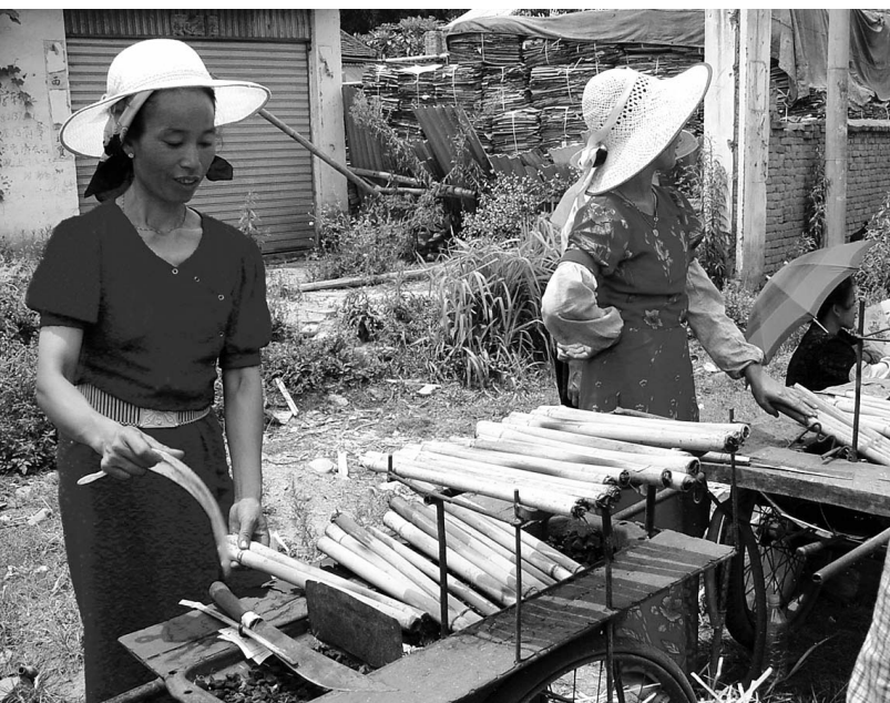
FIGURE 3 Dai women cooking rice in Cephalastrum pergracile containers.

nan's varied environments, which provide excellent growing conditions for bamboo. There are about 75 genera and 1250 bamboo species in the world. Of the nearly 500 species in 40 genera present in China, mostly in the monsoon areas south of the Changjiang River, over 250 bamboo species in 29 genera occur naturally in Yunnan.