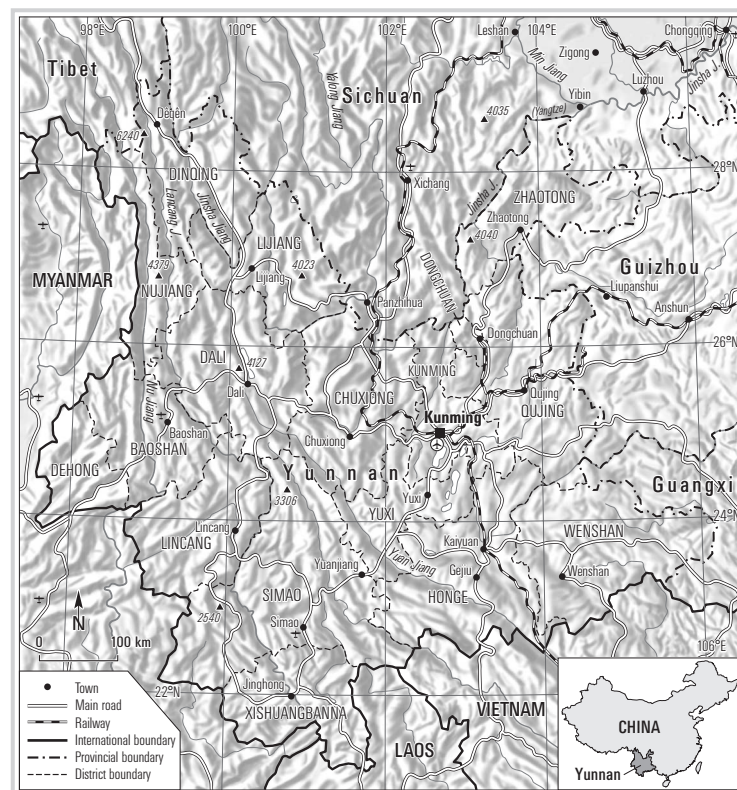
FIGURE 1 Map of Yunnan Province. (Map by Andreas Brodbeck)

The province of Yunnan is situated in southwest China. It covers an area of 394,000 km 2 . It neighbors Guizhou and Guangxi provinces in the east, Sichuan province in the north, and Tibet in the northwest, and has state borders with Myanmar in the west and southwest, as well as Laos and Vietnam in the south (Figure 1). Yunnan is a transition area between south China and the eastern Himalayas. In Yunnan, 3 major Asian climate zones come together: the tropical monsoon zone of South Asia, the subtropical monsoon zone of East Asia, and the Qinghai–Tibetan Plateau zone. This accounts for Yun-