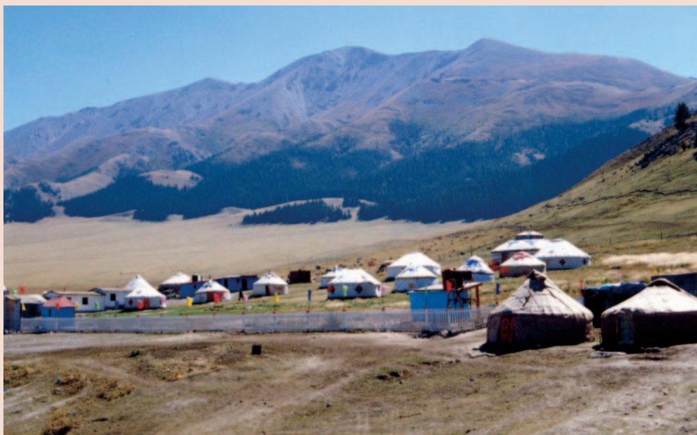
FIGURE 5 More sustainable tourist accommodations built by local people near Sayram Lake, in the Tien Shan; there are no permanent structures around the lake. Damage to the ground from tourist use can be repaired.

stand the significance of protecting world heritage sites and parks in mountains. Specialists, eg Xie Ninggao (Peking University) and Li Jisheng (Shandong Province), have revealed the problems of over-urbanization and landscape damage in mountains, and appealed for measures and actions to halt careless behavior. International pressure has forced some local governments to invest large sums to remove hotels and even local residents from scenic spots. In some areas, more sustainable tourism has been initiated (Figure 5).