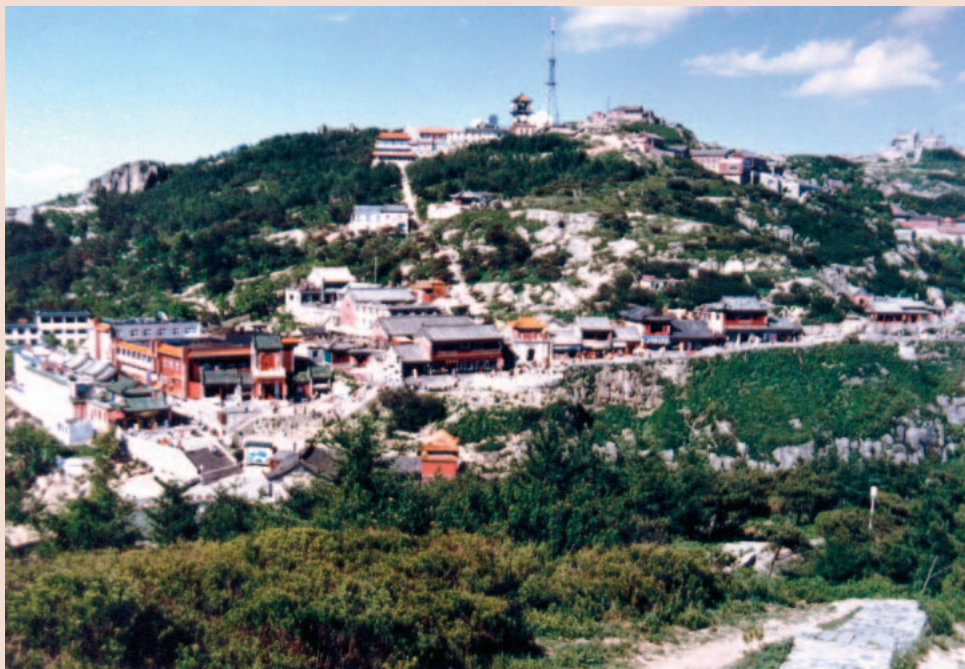
FIGURE 2 Sprawl of tourism facilities on the Yuhuang peak of Mt Taishan.

In recent years, average per capita income in China has increased rapidly, from about US$450–500 in 1990 to US$1000 in 2001, with peaks in cities and towns where many families now earn US$10,000 and more. People can therefore afford to travel within China and even abroad, especially during the 3 long holiday periods, also called the 3 golden weeks. Since 2000, holiday tourism has increased at a tremendous pace, leading to overcrowding (Figure 2). For example, Tibet recorded 686,000 tourists in 2001, 28.6 times more than in 1990. The Wulingyuan (Zhangjiajie) World Natural Heritage Site in northwestern Hunan Province—a typical tourist attraction—recorded 1.3 million tourists in 2002, compared with only 0.23 million in 1998 (Figure 3). Generally, the number of domestic tourists in mountain resorts has more than quadrupled in the last 5 years in China.