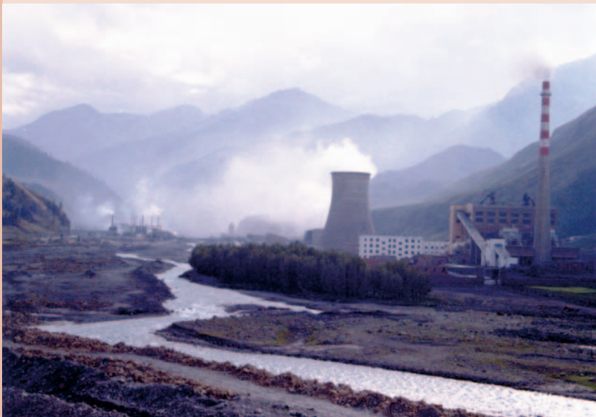
FIGURE 1 Cement plant built in the early 1970s in the mountains south of Urumqi, Xinjiang. The plant provided more than 300 local jobs but is the source of uncontrolled pollution. Distance from the city means there is lack of awareness of this negative impact.

The urbanization process has brought many problems. One is the emergence of landless peasants—a rapidly expanding and weak social group. Indeed, large-scale urbanization has led to confiscation of large areas of farmland. Although local governments have occasionally provided some compensation, the amount is usually very limited. In some cases, land was the farmers' only source of livelihood; they have become homeless, jobless, and in some cases have lost hope. Another problem is the helplessness of many peasants who leave their home towns in search of casual labor in the cities, but with almost no assurance of income and decent health. These people are the victims of urbanization.