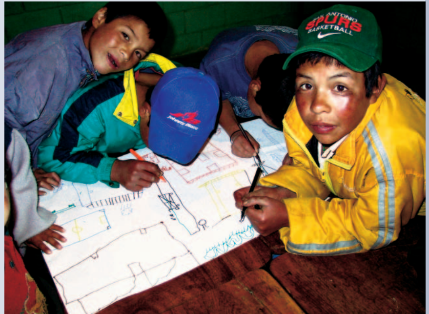
FIGURE 7 Children drawing their dream community in Tuñame during the problem analysis workshop.

process. In addition, preventing the violation of land use agreements will necessarily require strengthening the institutional capacity of community-based environmental organizations.