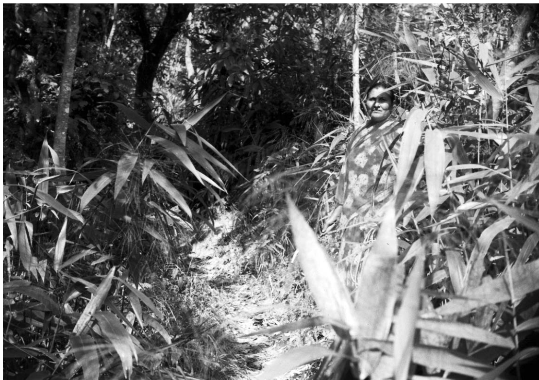
FIGURE 2 The Malati forest has multiple functions, thanks to its under-canopy layer where grass grows abundantly. The trail that runs in front of this woman's feet separates two plots.

forest products reach the depot, they are ready for selling. Users, based on their requirements and purchase capacity, buy the forest products.