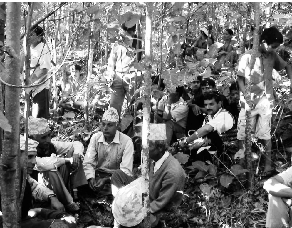
FIGURE 3 Bharkhore CFUG holds its general assembly inside a simple coppice demonstration plot; the members are discussing the possibility of catering to fuelwood demand and scaling up their management regime in the forest.