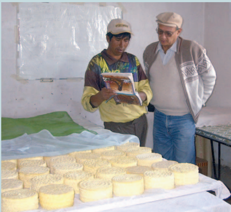
FIGURE 2 New techniques for producing and marketing cheese being discussed.

ners have been working to understand these complex systems and have developed technologies and knowledge to improve agricultural productivity, reduce poverty, ensure food security, and protect the environment. Additionally, work has been conducted to improve marketing and transformation (Figure 2). Thus,