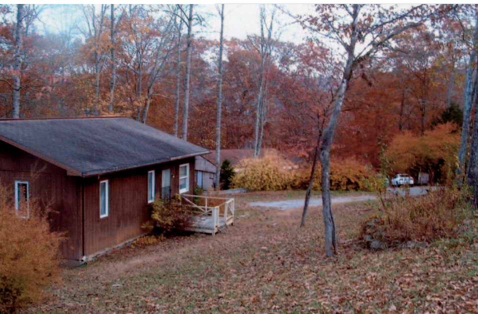
FIGURE 2 The first Land Trust house, designed by the Federation of Appalachian Housing Inc. The lower house on the right is a typical Tennessee Valley design. Mortgage financing for the Land Trust house came from the Churches.

“When poison escapes from the mines, the birds die and we humans take heed to fix the problem so that we may live. We who live in coal mining areas are, for our nation, what the bird is to the coal mining community. We belong to Earth. Earth does not belong to us. We are preparing for a post-industrial era and how we fade in and out of the real world is a challenge to all of us who dare to get involved.”