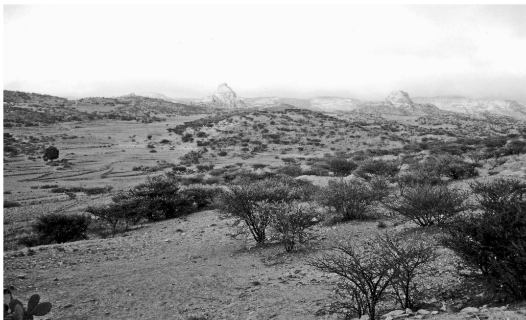
FIGURE 1B January 1997, near Adi Caieh.

der of the Italian commander to the Allies. A major source of information for this period is a series of BMA files containing detailed correspondence on matters relating to forestry issues. These files indicate that the British, like the Italians, were greatly concerned about the paucity of wood resources in the country. In an initial broad estimate of tree cover in the country in 1945, it was calculated that roughly 5% of the country as a whole was wooded (RDCE 1943). However, this estimate was revised upwards 2 years later in a more comprehensive survey of tree cover by province undertaken by the head of the Forest and Wildlife Department (Infante 1947). The findings indicated that 10% of the 3 central highland provinces consisted of wooded areas. This estimate is higher than that of Senni in 1905 but seems