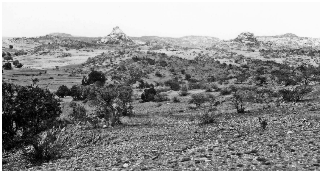
FIGURE 1A April 1930, near Adi Caieh.