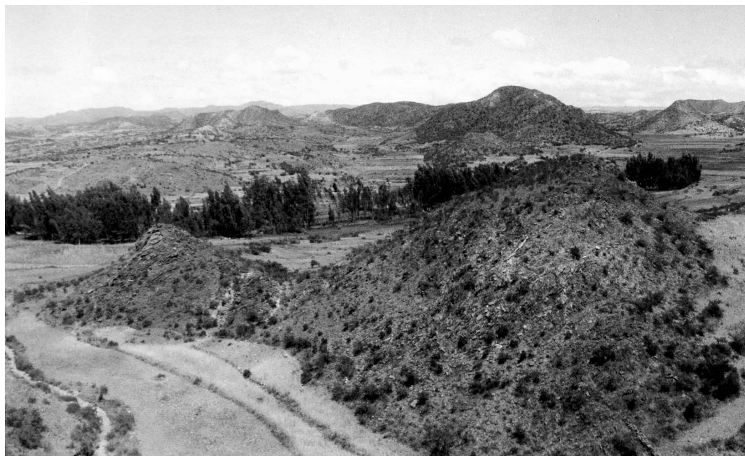
FIGURE 2A March 1971, Adi Cubollo.