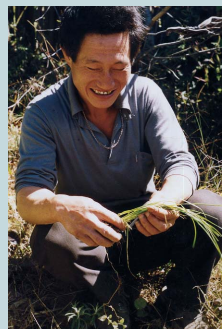
FIGURE 1 A farmer using his local knowledge in evaluating the characteristics of the exotic black rye grass ( Lolium perenne ) in comparison to local fodder sources and in experimenting with different planting methods.

Members of agropastoralist communities often have rich indigenous knowledge relating to animal husbandry. Surveys have found that experienced herders are able to list and elaborate on the properties of more than 50 species of fodder grass (Figure 1). A range of indigenous practices can be found that enhance animal productivity, such as feeding chicken or goat meat to cows after they have given birth, thus increasing milk yields and promoting ovulation. Traditional social arrangements between relatives and neighbors are a common way of mobilizing labor for herding. Given that the availability of natural fodder resources varies greatly over space and time, most transhumant communities have their own—traditional or more recent—arrangements for managing the use of grasslands.