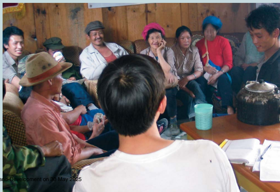
FIGURE 4 Project staff discussing establishment of a revolving drug fund with villagers.

In this process, we have been encouraging both community members and extension workers to pay attention to the potential of local knowledge. For example, villagers in Bahang hamlet were almost unanimous that winter fodder shortage was a major problem affecting cattle health and milk yields. A group began to experiment with exotic fodder grass species. Although the grasses grew well, several of the farmers rejected them. They explained that cattle health depends on maintaining ‘vital energy,’ and that although the grasses were good, they were not as restorative of ‘vital ener-