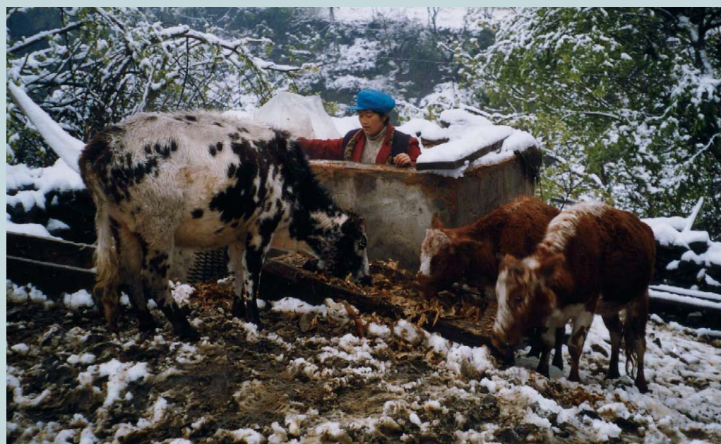
FIGURE 3 A woman observing whether her cattle like to eat silaged cornstalks.

“People without silage fodder, their cattle died in the heavy snowfall. Even though I have the biggest number of cows in the hamlet, they all survived the snow. Everyone can see the benefits now.” (A farmer who experimented with silage fodder)