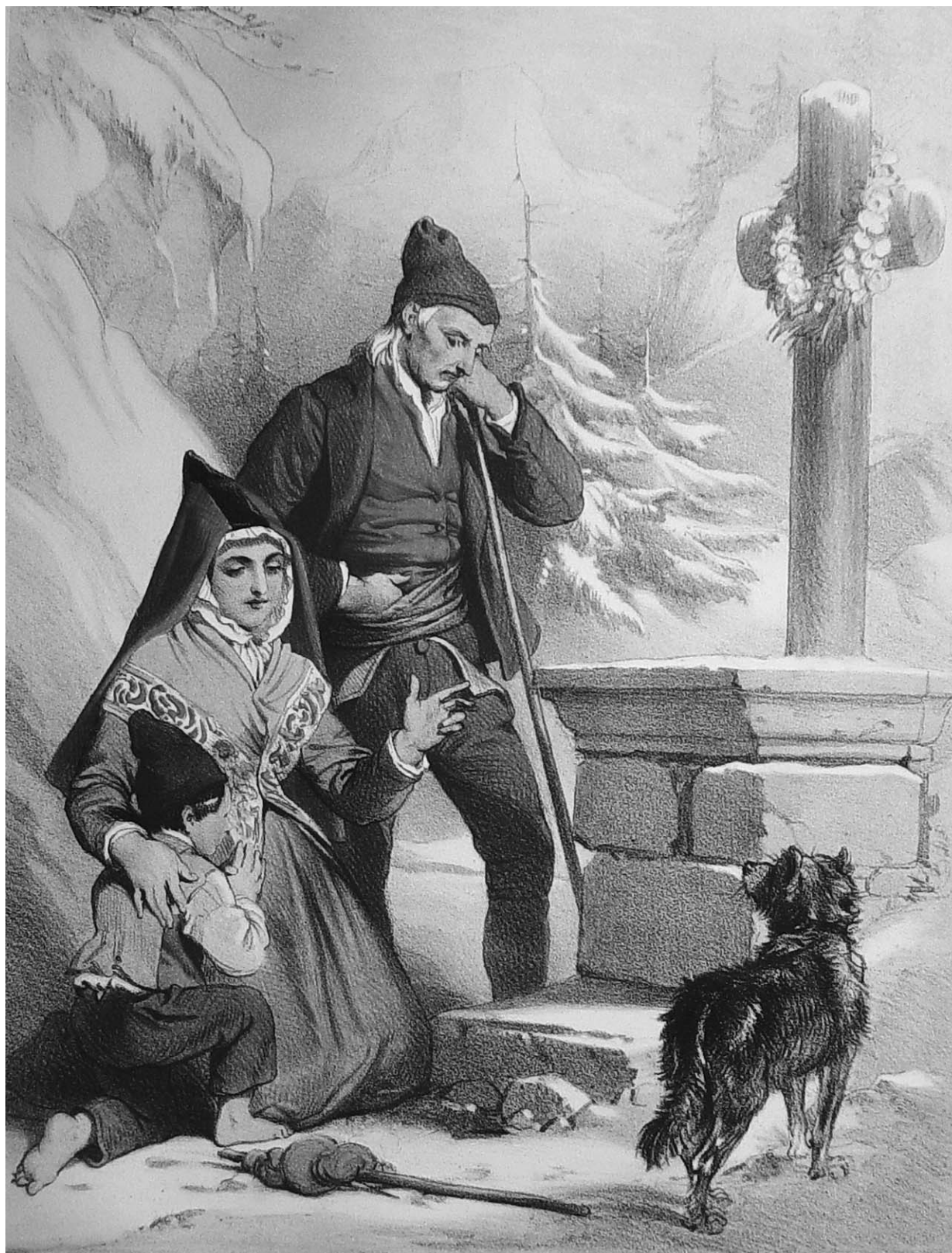
FIGURE 3 "A family in Barèges" (Vallée de Barèges, Central Pyrenees, France). Mid-19th century representation of a very conventional scene with unconventional costumes: Pyrenean society is imagined as Arcadia. This saint-sulpicienne picture (like the pious imagery and statuary selling in the shops around the church of Saint-Sulpice in Paris) represents a pretty young woman who drops her spindle to teach her child—barefoot in the snow—how to pray. A shepherd, with his crook and sheepdog, is more meditative than pious. Thus it is the mother who transmits belief in God. Why was the cross erected—to commemorate a dramatic event or remind passers-by of God? (Lithograph by Alfred Dartiguenave)