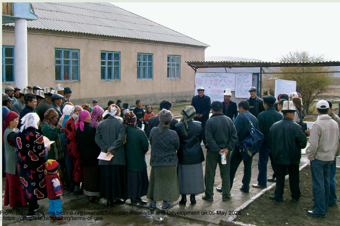
FIGURE 2 The main instrument and potential of TPSs (normally represented by a limited number of active people) is their ability to mobilize the majority of the village population when the need to discuss and solve different problems arises. Jergetal village, Kyrgyzstan.