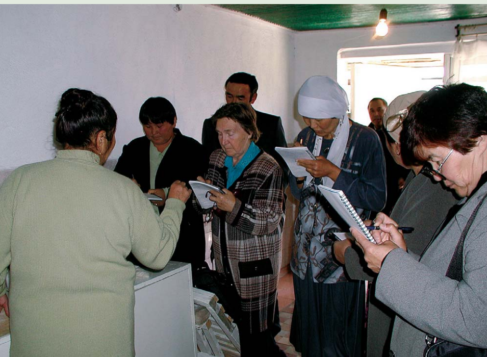
FIGURE 3 Exchange of experience between villages is the main idea of AGOCA: CAMP training in Swiss cheese-making technology for women in Akshi, Kazakhstan.

“Alpine experience has already been passed on to Central Asia. What started in November 2002 in Bishkek has already borne fruit. In the Caucasus region a first step towards a transboundary community network was taken, together with an initial eight pilot communities from four countries: Armenia, Azerbaijan, Georgia, and the Russian Federation. Cooperation between three mountain regions—the Carpathians, the Caucasus, and Central Asia—and other regions could generate