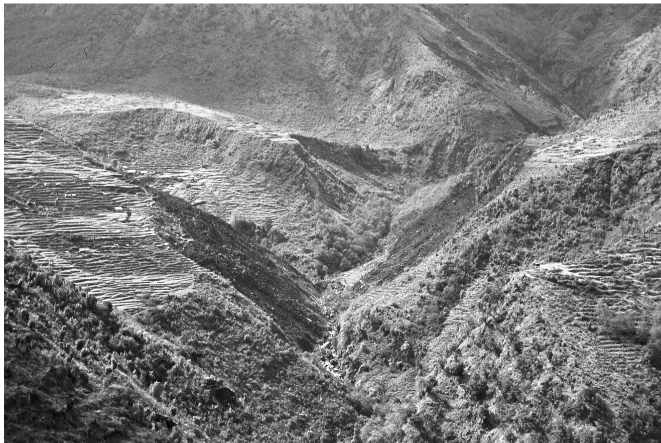
FIGURE 3 Forest near Lowagen affected by slash-and-burn maize cultivation. After harvesting maize, the cultivated field is usually abandoned. Recently, people have started cultivating chiraito ( Swertia spp.) with maize.

chiraito ( Swertia spp.) as cash crops. Dynamic changes in forest/agricultural lands in the Middle Mountains of Nepal are also discussed by Kollmair and Müller-Böker (2002). This important topic should be studied systematically in the future.