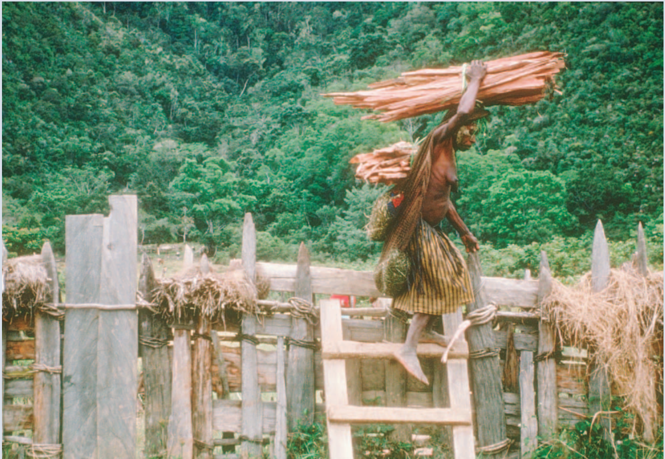
FIGURE 6 Firewood vendor in New Guinea; sustainable use of resources is a characteristic of mountain communities in this area of the world.

world, along with assessing their potential for appropriate and sustainable development.