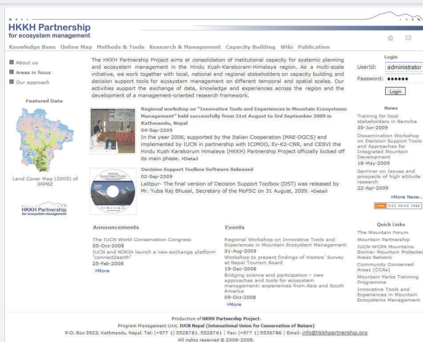
FIGURE 1 Main page and user interface of the IWP.

The IWP has been designed and built with a customized content management system (CMS) focusing on the project contents by establishing simple and easy management of information resources through a workflow process and a common framework for information authoring, approving, publishing, and archiving. This framework provides techniques that assist in the development of ideal information environments (Batley 2007). In addition, the IWP system was designed keeping in mind that novice users with little or no technical background can use, operate, manage, and maintain the web portal involving a diverse user community and remote locations. Figure 2 outlines the architecture of the IWP, and the subsequent section describes its major modules.