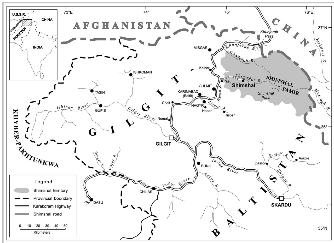
FIGURE 1 Location of Shimshal in the Gilgit-Baltistan province. (Map by David Butz)

Road building is an important aspect of rural development in the global South (Obut 1986; Wagner 1990; Njenga and Davis 2003). Governments and development organizations largely assume that as roads increase rural accessibility and the circulation of people and goods, they also bring greater prosperity and an easier, more secure way of life (Wilson 2004). However, little development studies research has systematically analyzed the implications of roads for communities that are newly connected to the “outside.” Important research exists on the social effects of rural roads in northern Pakistan (Grotzbach 1984; Allan 1986, 1989; Ispahani 1989; Kreutzmann 1991, 1993, 1998; Uhlig and Kreutzmann 1995; Kamal and Nasir 1998; Wood and Malik 2006), but it focuses mainly on mesoscale material effects in terms of land use patterns, agrarian economies, and migration patterns in the region. They overlook the discursive aspect of social change—the community representations of roads that mediate material change. Detailed longitudinal case studies are needed at the scale of particular communities and from the perspective of the people involved to understand more fully the complex implications of new roads for community organization, development outcomes, and the sustainability of those