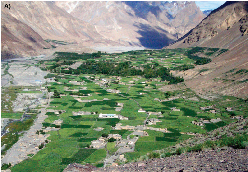
FIGURE 3 (A) Shimshal center in July 2007 with the new road bisecting the settlement. (B) A difficult section of the route to Shimshal, showing the old footpath and the partially completed road. The photo was taken in July 2000, when this section of the road was being constructed.