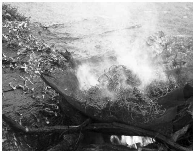
FIGURE 4 Drying of kutki in hearths, using local fuelwood.

weight of fresh material is reduced by half. Around 70–80 kg of fuelwood is burned in the process. The major species used for fuelwood are Juniperus indica , Rhododendron campanulatum , and Betula utilis . The distance traveled to collect fuelwood varies from 1.5 to 2.5 km. This requires 4–8 hours per week. Thus, in addition to collection, processing of raw material is also a backbreaking task.