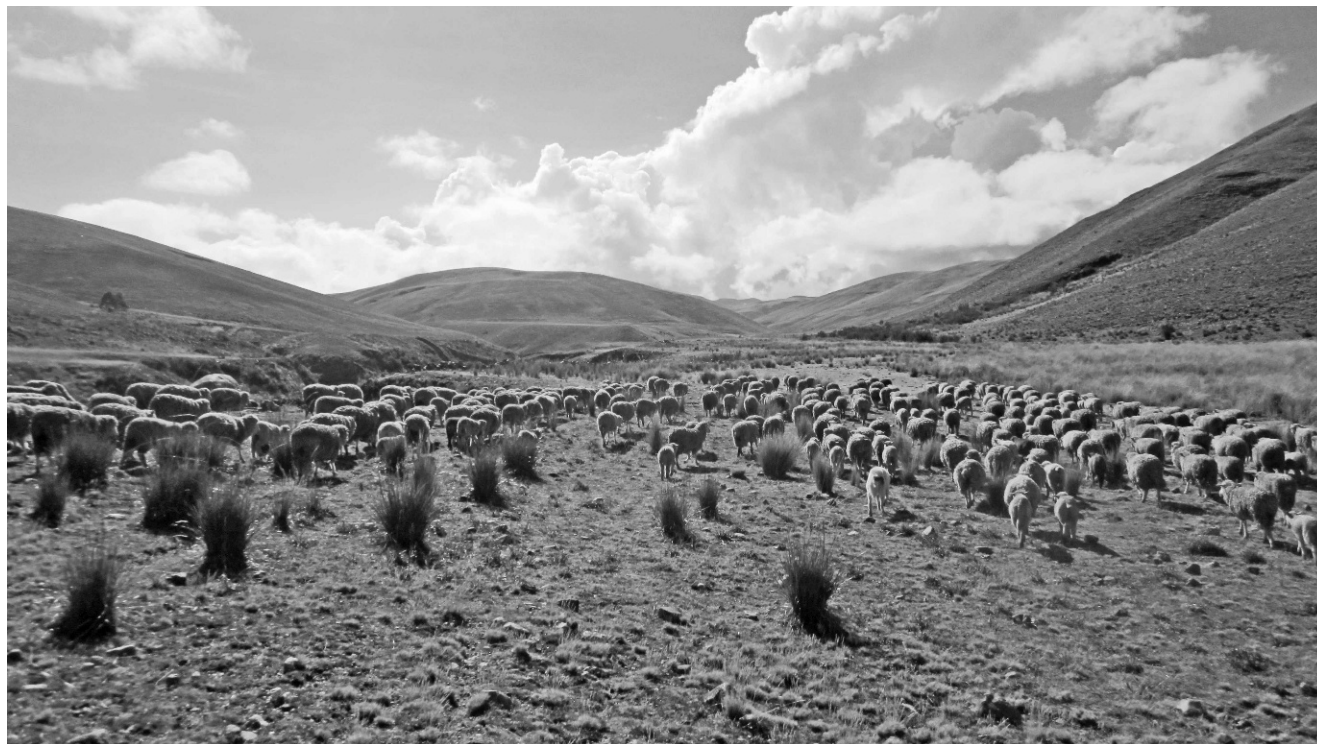
FIGURE 3 Many of the members of the community have flocks of sheep that, like this one, consist of both their own and others' animals.