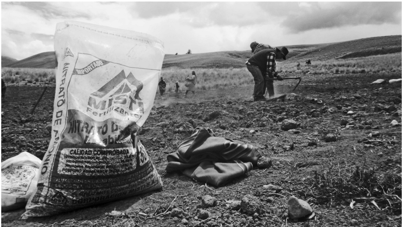
FIGURE 1 Working in the field is hard manual labor. Preparing for potatoes also requires synthetic fertilizer that must be purchased in Huaraz.