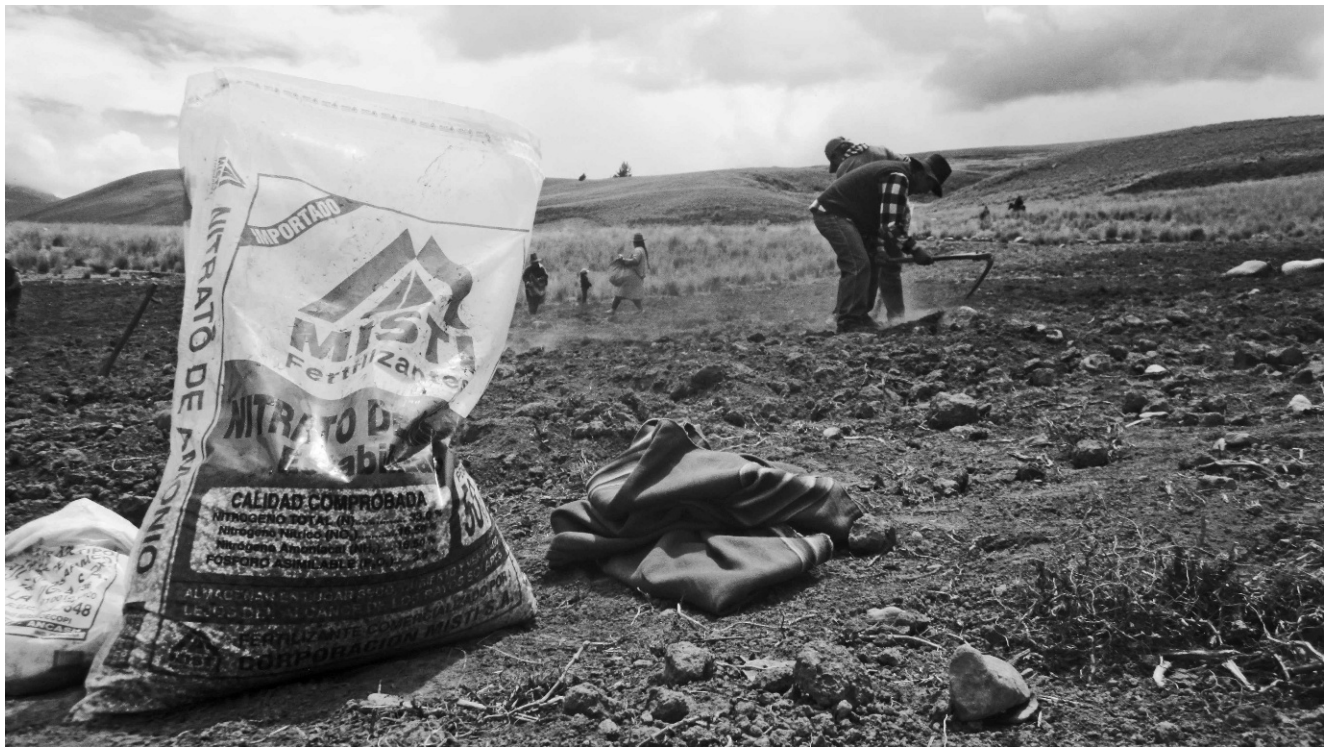
FIGURE 1 Working in the field is hard manual labor. Preparing for potatoes also requires synthetic fertilizer that must be purchased in Huaraz.