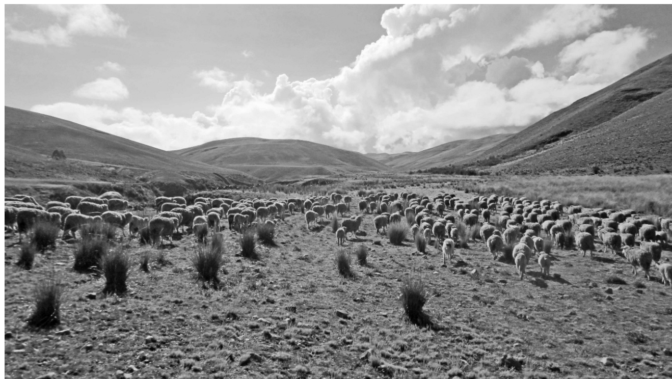
FIGURE 3 Many of the members of the community have flocks of sheep that, like this one, consist of both their own and others' animals.