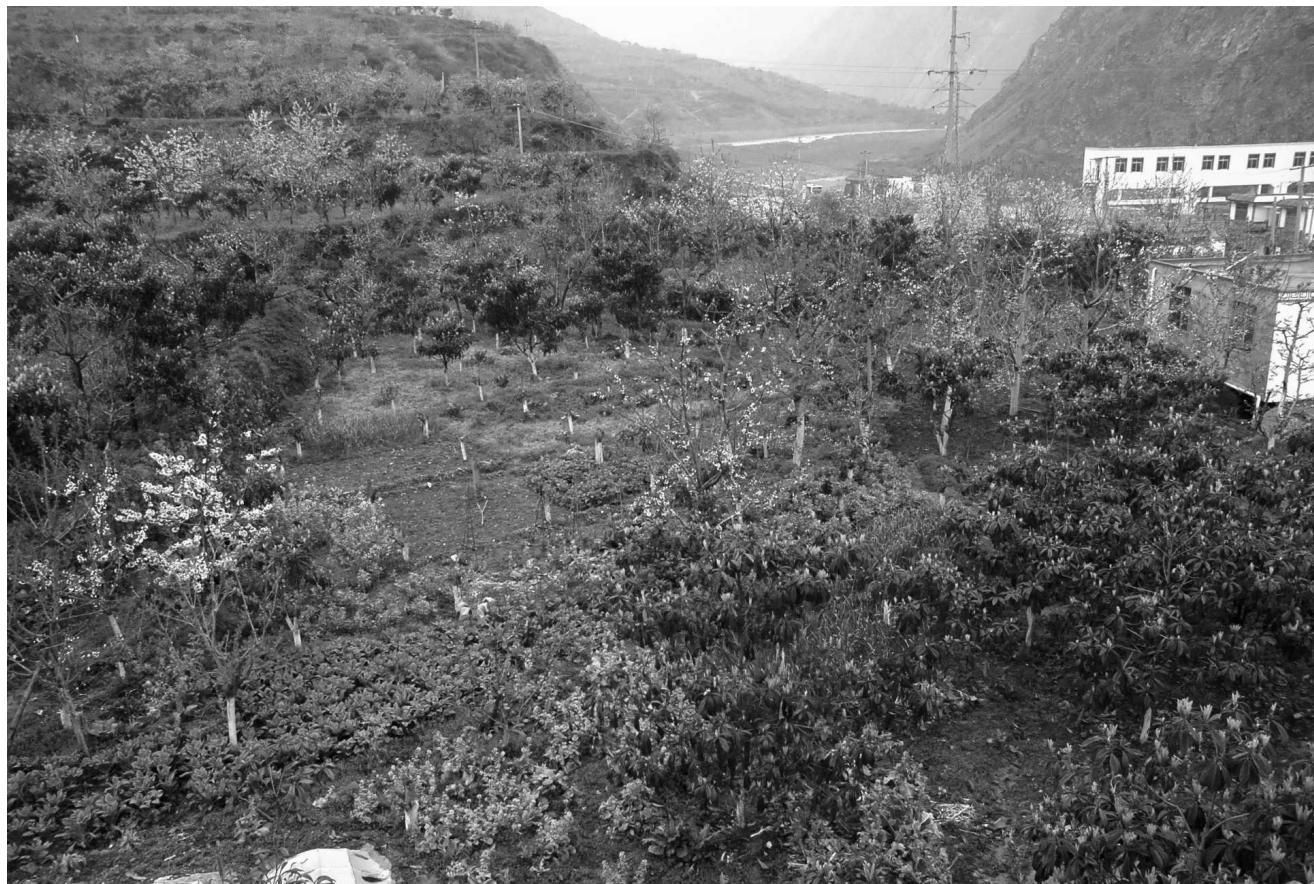
FIGURE 4 Mixed fruit farming in study area. An orchard with apples, cherries, plums, loquats, and vegetables in Feng Mao village.

hiring them varies from US$ 12–19/person/d, which has led to a substantial increase in the cost of producing apples. This, coupled with the falling market prices for Maoxian apples, has been the key factor that compelled farmers to look for other crops.