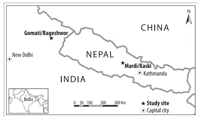
FIGURE 2 Location of study villages. (Map by Prem Sagar Chapagain)

conservative ones in Nepal. The twofold intention of the comparison is, as stated previously, to document variation and to identify circumstances that are favorable to innovation.