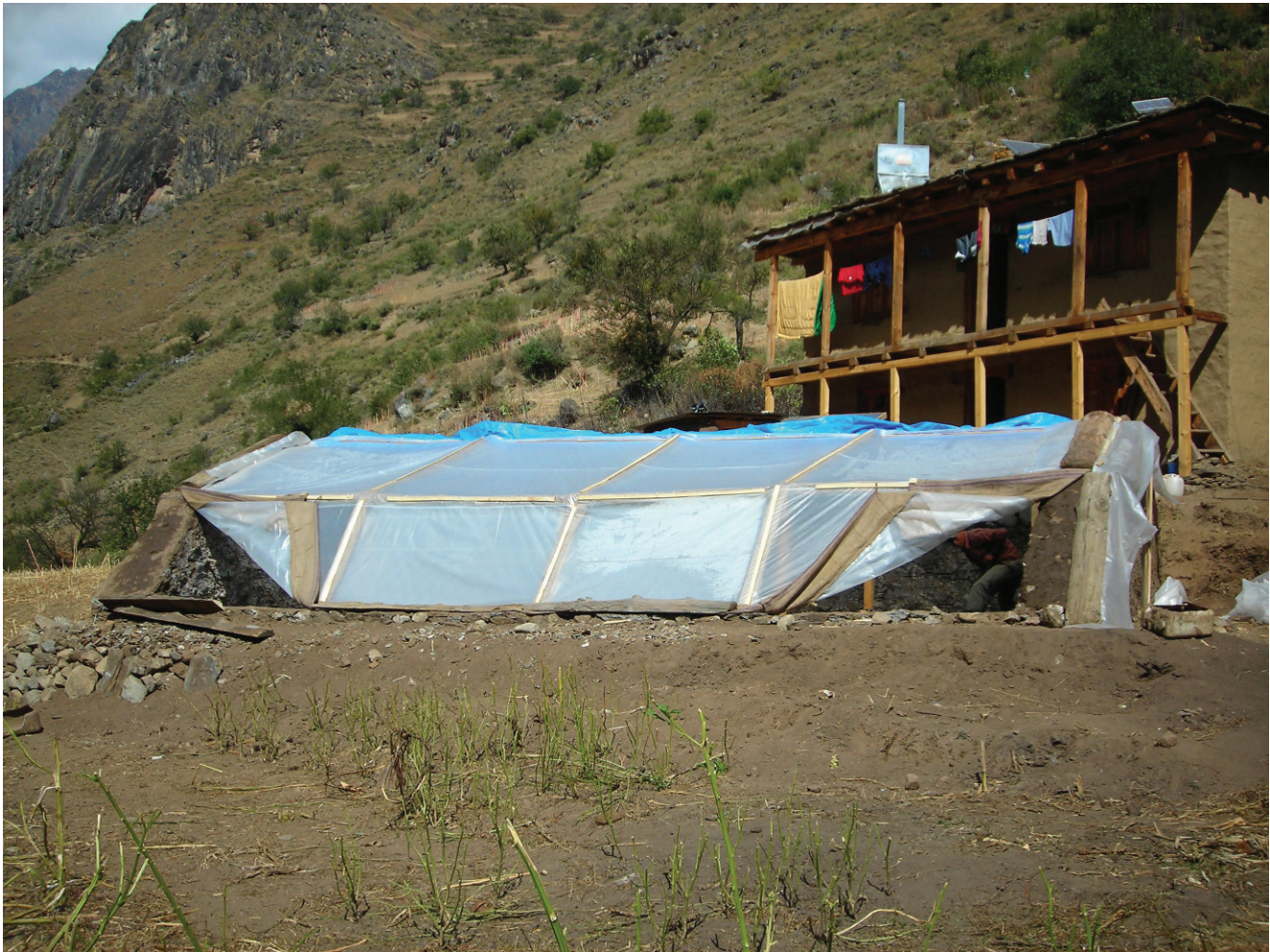
FIGURE 4 GERES-style greenhouse at Dharapori.

on measured hourly climatic data for 1 week in November. The validated model was then used to investigate options to improve the thermal performance of the greenhouse. The measurements showed that, in mid January during the night time, the subsurface soil temperatures within the greenhouse were approximately 7–9°C warmer than at a similar soil level outside. At 600 mm below the surface, the soil temperature in the greenhouse did not fall below 10.3°C. Air temperatures within the greenhouse in mid January were approximately 7.5°C above the outside air temperature. Although not ideal, the measurements over the winter months indicated that the growing conditions were certainly suitable for some vegetable crops such as spinach, carrots, and beans.