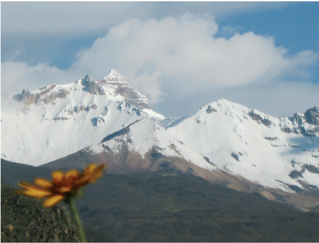
FIGURE 3 The glaciers of Mount Hualca Hualca are an important source of water.

According to Gelles's study of 1987, the Peruvian state made numerous attempts to introduce a state model of water governance, with the aim of making water distribution more efficient; but it encountered stubborn