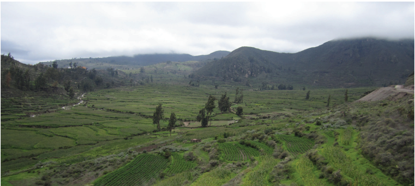
FIGURE 4 The campiña of Cabanaconde, the village's largest agricultural area.

resistance from Cabaneños (Gelles 2000: 69–74). A small group of villagers supported the state's attempt to modernize water management, but the majority opposed it, pointing to the advantage of using a dual model that