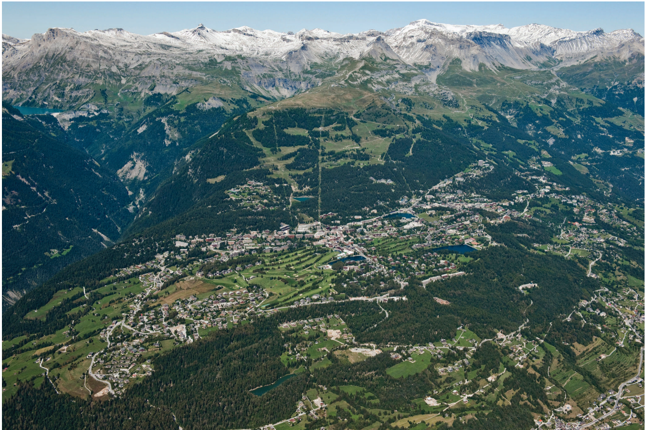
FIGURE 1 Part of the Crans-Montana-Sierre region. In the middle is the tourism resort of Crans-Montana, with several reservoirs, golf and skiing areas are in the background, the Tseuzier reservoir is at the top left, and agricultural and settlement areas at the lower right.

agreements that have not been formalized, for example, through a written contract; this includes customary law. Sometimes, these agreements are so deeply rooted among the actors involved that they become a tacit understanding.