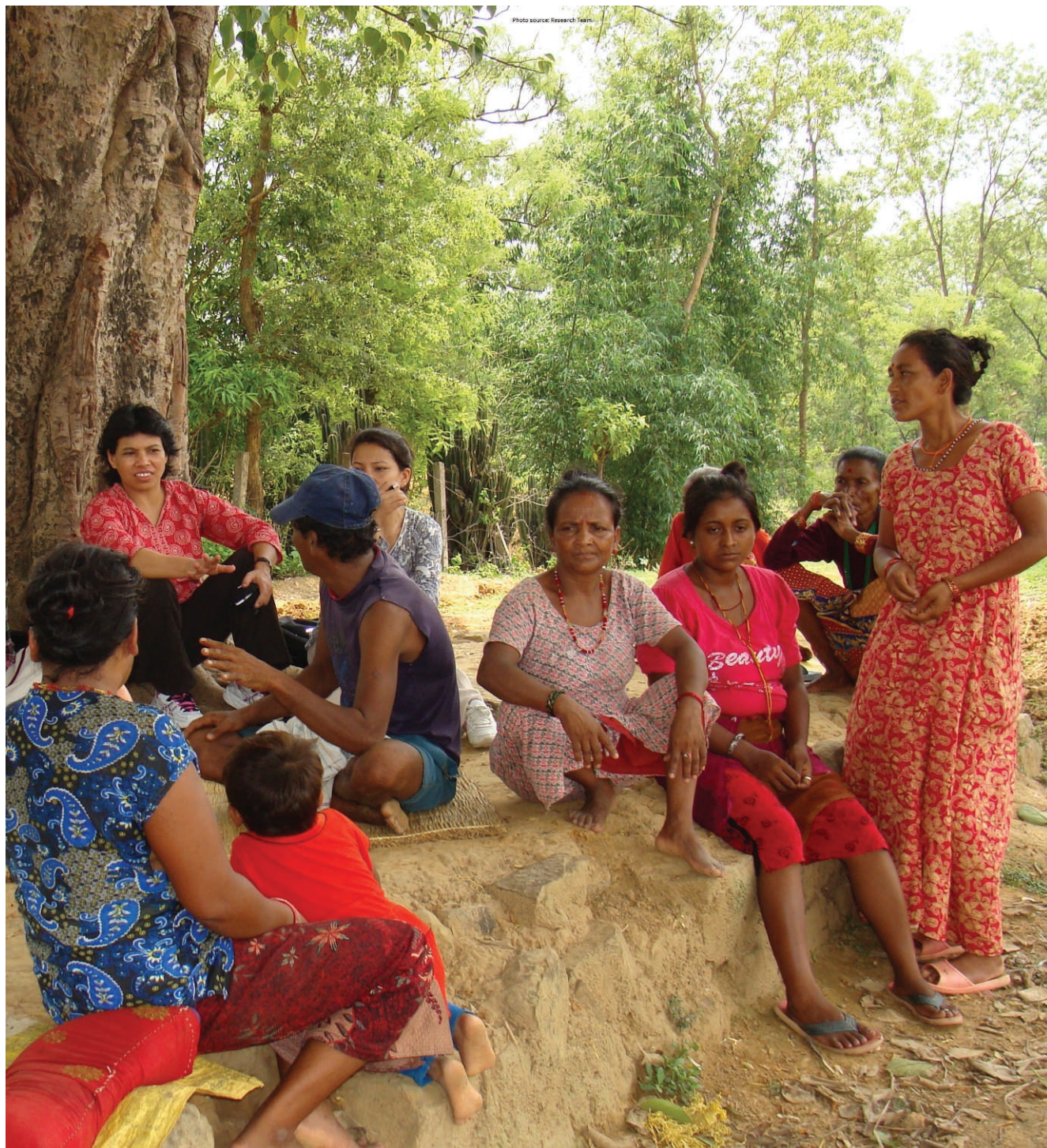
FIGURE 3 Dalit man explaining how Dalits in his community are participating in the REDD+ process.

provided more input during meetings. The gender-unequal structure of the committees and their technical agendas often discouraged women from raising their concerns openly and participating effectively in meetings (see also Nightingale 2002, 2006). A woman member of the