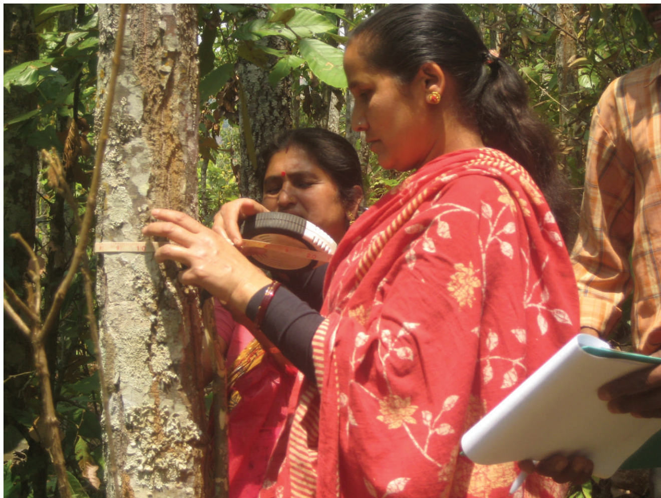
FIGURE 1 Woman forest user learning how to measure tree girth in the REDD+ pilot site.

ethnicity, wealth, and location produce many institutional challenges to the empowerment of the poor, women, and socially excluded groups in Nepal (Nightingale 2005, 2011; World Bank and DFID 2006; Khadka 2009).