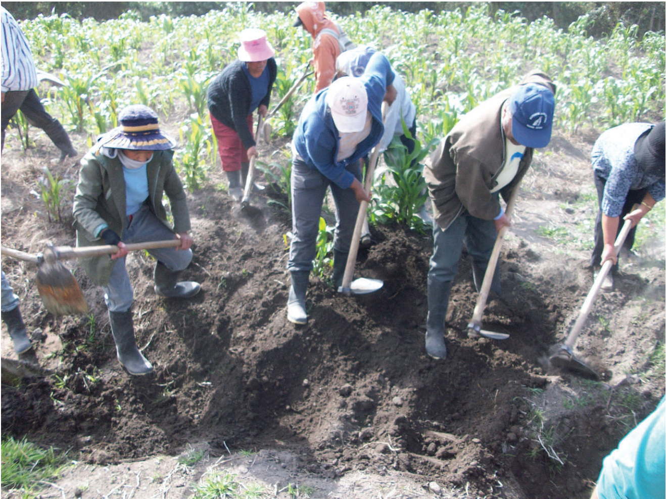
FIGURE 2 Resettlers in a collective work party ( minga ) rebuilding an irrigation network in the high-risk zone at the foot of the volcano. Minga is one of many forms of cooperation and reciprocity practiced in the area.