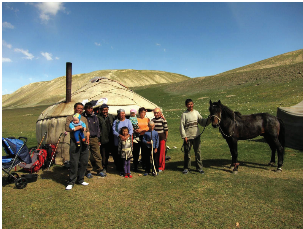
FIGURE 2 A family portrait in the jailoo (summer pasture) in Kyrgyzstan.

stay. Thus, herders have the most immediate impact on livestock and pasture productivity.