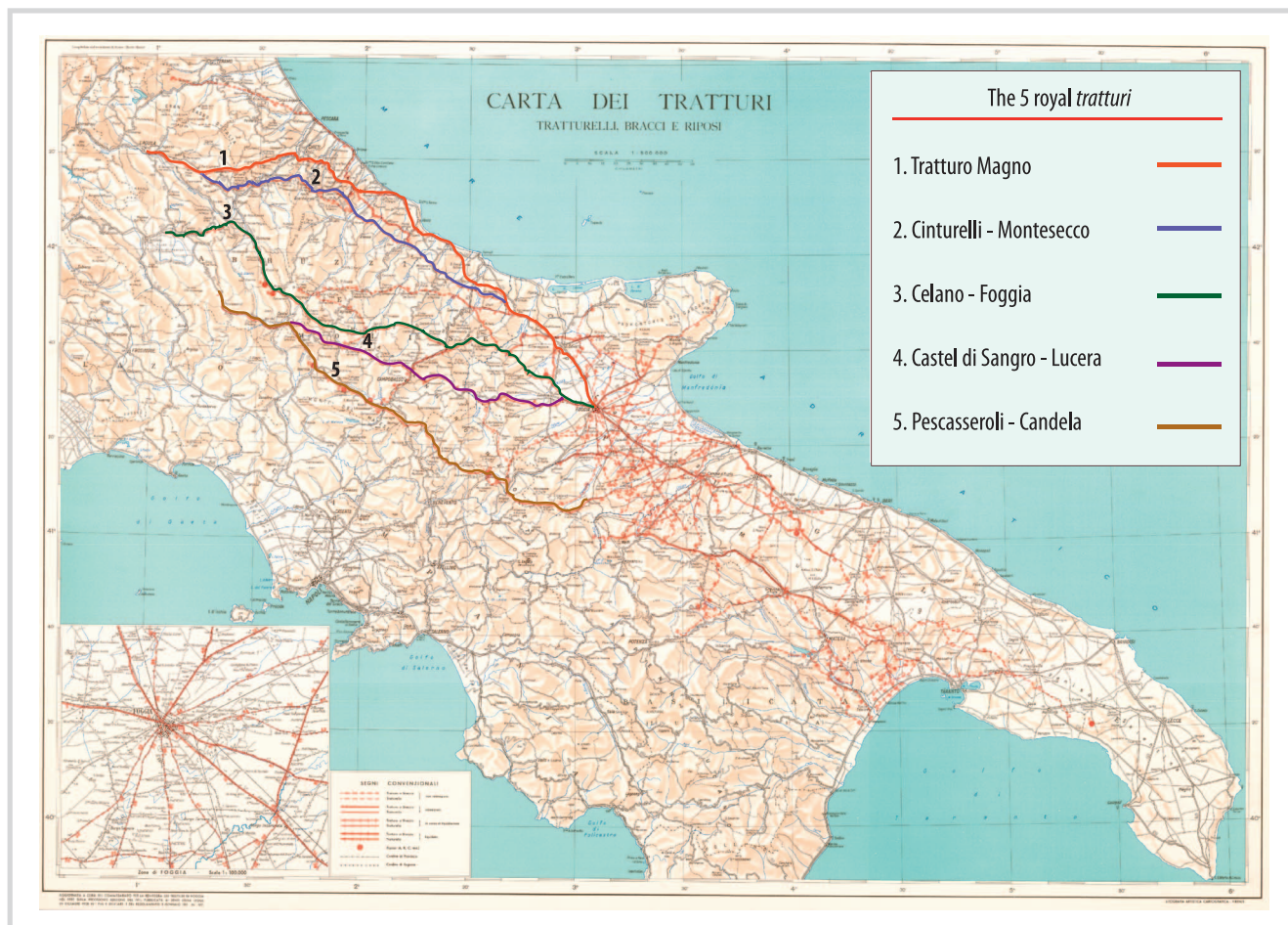
FIGURE 1 The network of tratturi in southern Italy, and location of the 5 royal tratturi . (Map provided by the Regional Office of Tratturi, Foggia, and adapted by the first author)