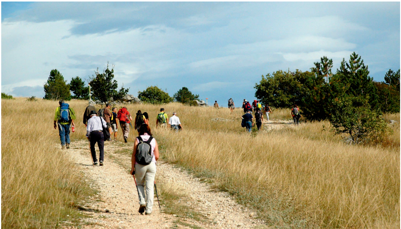
FIGURE 2 Trekkers along the Tratturo Magno.

length. Hereafter, activities related to restoring this section of the Tratturo Magno and the Regio Tratturo Cinturelli-Montesecco are referred to as the Tratturo Magno project. These paths traverse 10 municipalities that were badly affected by the April 2009 L'Aquila earthquake. The lead author of this paper, an Italian social research consultant, was engaged by the Local Action Group Gran Sasso-Velino to support the Tratturo Magno project by gathering tourism data and assisting with community engagement activities.