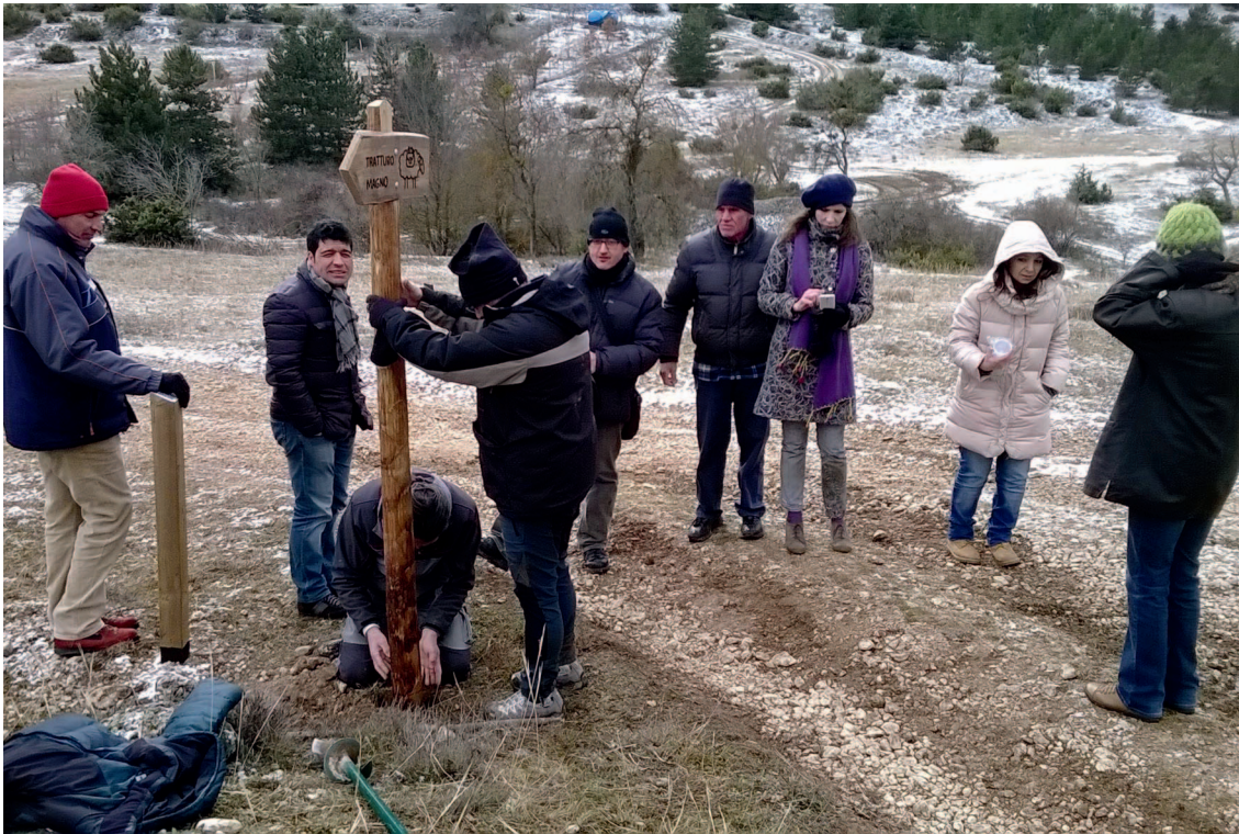
FIGURE 5 Members of a local community group erecting handmade wooden signs outside the mountain village of San Demetrio Ne' Vestini on the Tratturo Magno path. The village mayor is second from left. The shorter post displays a QR code to access information about the site.

Tratturo Magno project outcomes, especially in relation to the need to better manage the restored path and local cultural and natural heritage. These discussions, which were continued in the fourth phase of the SIA Framework for Action, resulted in the creation of a legal entity, the network agreement Landscapes in Transhumance.