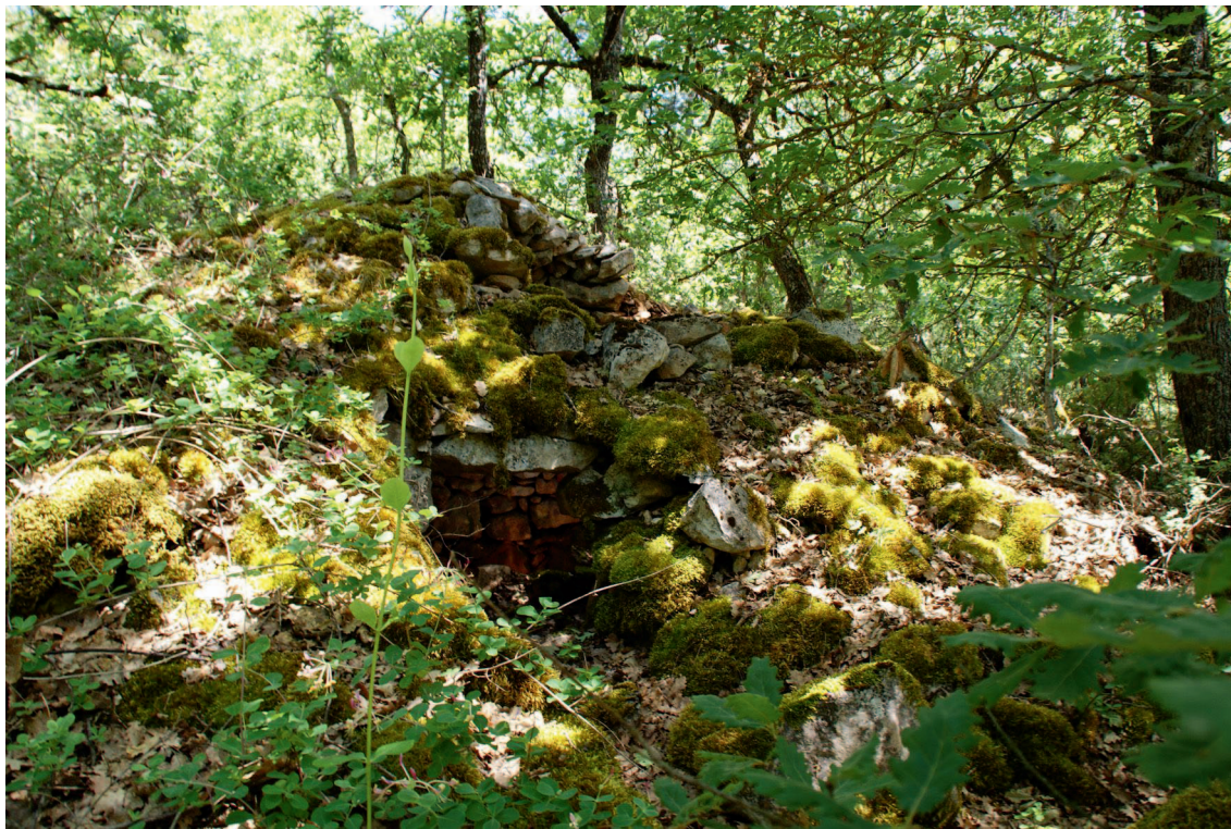
FIGURE 4 An ancient shepherds' refuge.

historic milestone markers along the Tratturo Magno. The landscape analysis also revealed that most cultural heritage along the path was overgrown or in disrepair. A geographic information system was used to georeference any identified heritage resources. This process supported the participatory visualization and community mapping processes during the “engaging” phase, which helped facilitate a shared vision of local cultural and natural heritage resources.