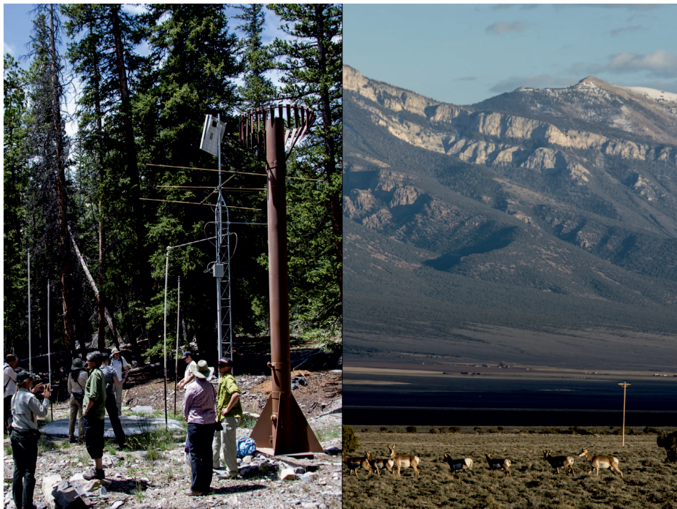
FIGURE 1 Only 1 Snow Telemetry station is present in Nevada's Snake mountain range (39°N 114°W; NRCS 2015), a zone containing the state's second-highest conifer diversity (Charlet 1996). This site (left) is located at 3060 m at the center of a heavily vegetated drainage. Atmospheric observations made here (such as daily maximum and minimum temperature) are unlikely to be representative of the vast majority of locations in the mountain range, which possesses numerous open woodland slopes and exposed topography both below and above the treeline (right).

sciences (Tenopir et al 2011; Michener et al 2012; ESIP Envirosensing Cluster 2016).