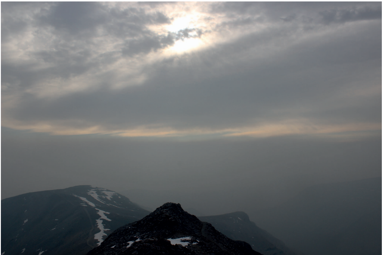
FIGURE 4 View from a mountain lookout with visibility reduced to 1 km by wildfire smoke from Washington State Okanogan fire, August 2015.

events. Lookout observers offer a unique perspective on wildfires, experienced predominantly as smoke. This experience extends to communities in the mountains and beyond who might similarly experience wildfires at a distance, and it contributes to thinking about experience at the periphery of wildfires, and extreme weather events more broadly.