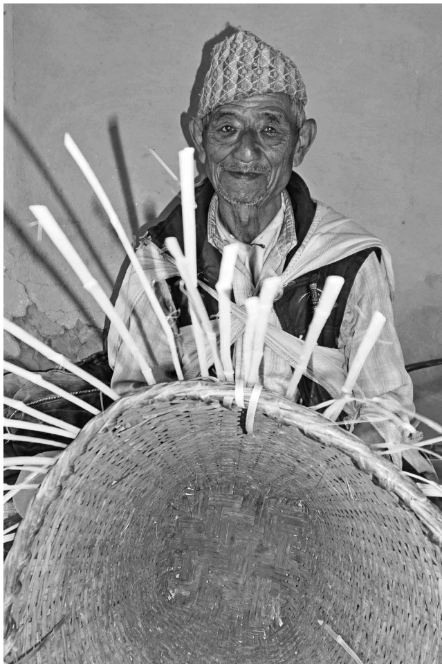
FIGURE 3 An 82-year-old Tamang man braids a doko (bamboo basket) to sell, Machhapuchhre VDC, 2016.

on agriculture, changing behavior of younger people, changing living arrangements, living conditions, mobility on uneven terrain, support from family members, access to pensions and other allowances, land ownership, poverty, exclusion, marginalization, and ageism. To present all aspects would be well beyond the scope of this article. This section focuses on the aspects that were considered the most relevant by the elderly themselves.