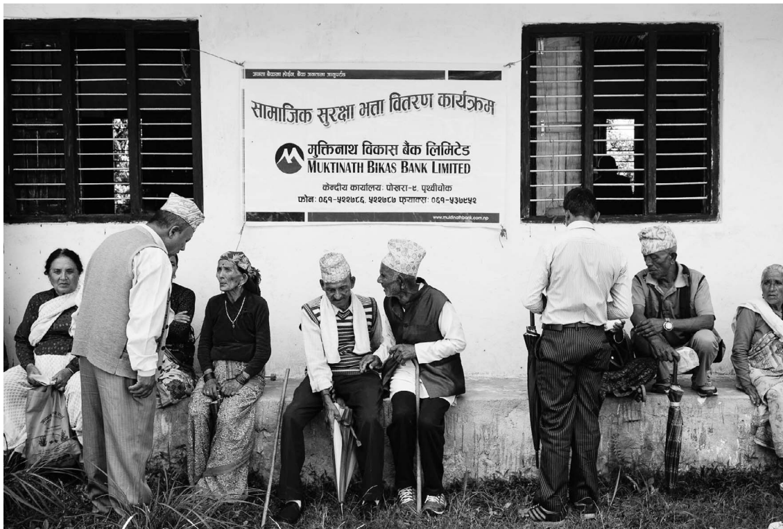
FIGURE 5 Elderly people wait to register for a bank account to be eligible to receive their noncontributory pensions, Ghachok VDC, 2016.

burdens is farm work; but due to age-related physical limitations, older people are also often compelled to reduce their farming activities or give them up altogether. Though farmland is still seen as a valuable resource by the elderly, as they connect land ownership with security in old age (see also Niraula 1995) and with authority within the household, there are indications that land ownership is not that important anymore. Migrants who provide a large proportion of the household income are seen to have a better reputation than people who stay at home and continue farming. This was also apparent in this study when elderly people reported feeling ignored and marginalized, excluded for example from the common kitchen, which means they do not have a say in the household anymore now that they are not the main contributors to the household budget. The traditional idea of farming as a joint project of a whole household has declined due to alternative, non-land-based livelihood strategies in combination with outmigration, which radically modifies this familiar structure.