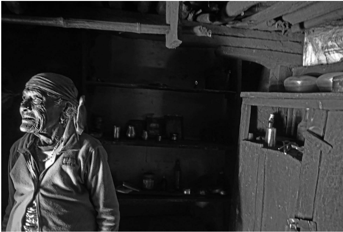
FIGURE 4 An 83-year-old Gurung woman stands in her kitchen, Ghachok VDC, 2016. The woman's daughter-in-law and 2 grandchildren, who live under the same roof, have a separate kitchen.

in household structure. Though the traditional patrilineal joint-family structure is still solidly embedded in people's minds, this cultural norm is declining in practice. As a 66-year-old woman said: "At that time, we used to have a joint family. Sons, daughters-in-law, and children, everybody used to live in the same house ... but now, from an early age, children are sent to school. After completing 10th or 12th grade, they go to foreign countries"