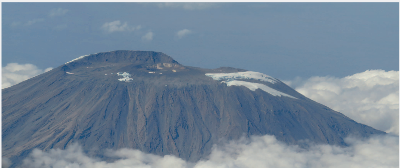
FIGURE 3 About 85% of the glacial ice on Mount Kilimanjaro disappeared between 1912 and 2011. Estimates vary, but several scientists predict it will be gone by 2060 (Earth Observatory, 2012). Such knowledge is key to informing SMD policies.

As knowledge is key to informed decisions (Figure 3), ARCOS developed an online platform, the ARCOS Biodiversity Information Management System ( http://arbims.arcosnetwork.org/ ), to facilitate information sharing on issues pertaining to SMD. In the same framework, stakeholders also joined hands to enhance knowledge of Africa's mountains by collecting and packaging information. Those include, among others, ARCOS's