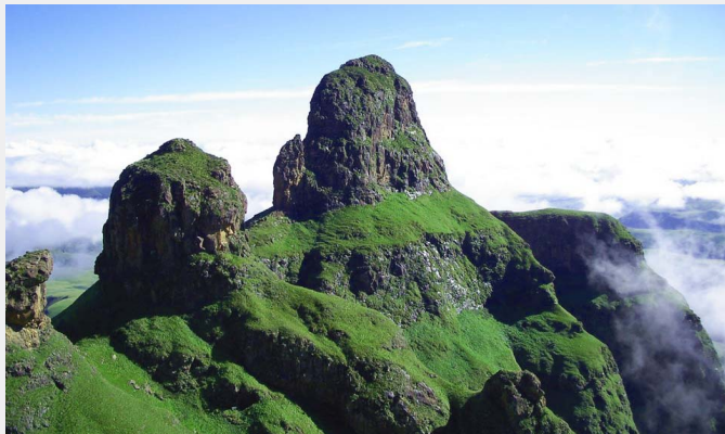
FIGURE 3 The ARU welcomes collaborations and partnerships to study southern African mountains as social–ecological systems and to achieve a science–policy–action interface for their sustainable development. (The Camel, ~2800 m, Cathedral Peak Area, uKhahlamba–Drakensberg Park and UNESCO World Heritage Site)

The ARU welcomes collaborations from across southern Africa, the Africa continent, and globally that align with our vision and mission and seek to partner with us to achieve our objectives for a sustainable future for southern African mountains (Figure 3).